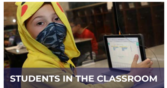
STUDENTS IN THE CLASSROOM

Read critically, write to learn, create, plan, problem solve, debate and ask questions.