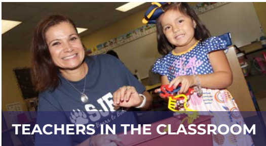
TEACHERS IN THE CLASSROOM

Learning-Centered instruction that is tied to learning objectives (brief statements that describe what students will be expected to learn and do), metacognition (awareness and understanding of one's thought processes), and differentiation (tailoring instruction to meet individual student needs).