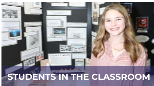
STUDENTS IN THE CLASSROOM

Create a rich learning environment that fosters motivation to learn.