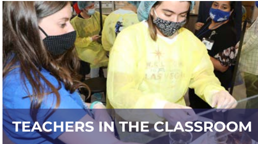
TEACHERS IN THE CLASSROOM

Development of critical thinking skills (analysis of facts to form an idea).