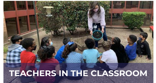
TEACHERS IN THE CLASSROOM