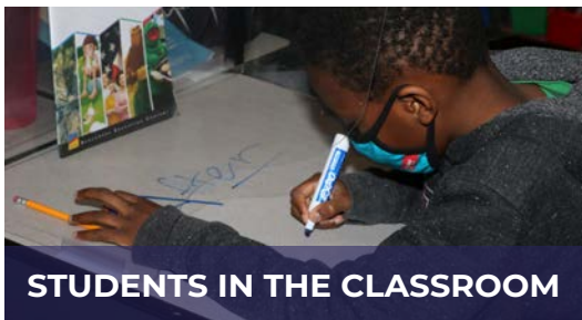
STUDENTS IN THE CLASSROOM

Provide tasks that promote reasoning and problem solving.