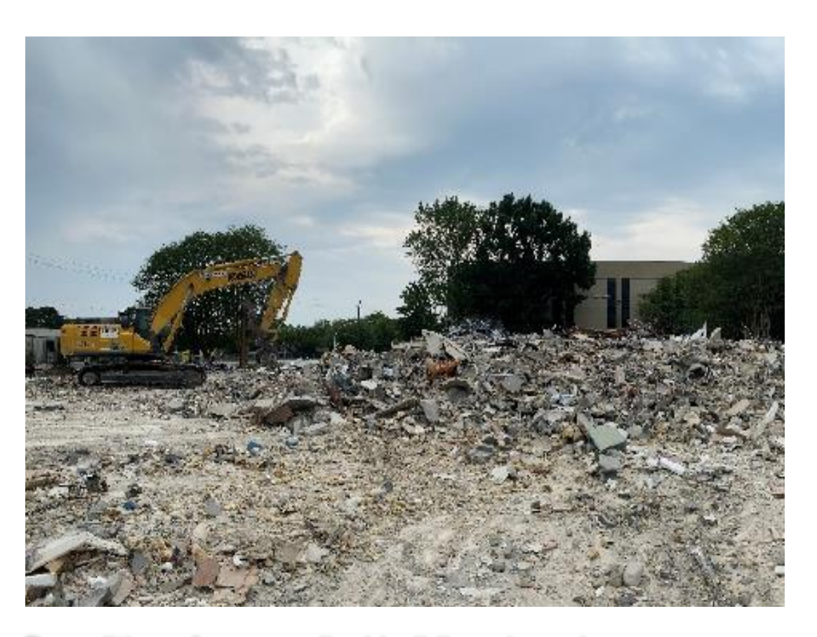
Demolition of rear medical buildings is underway