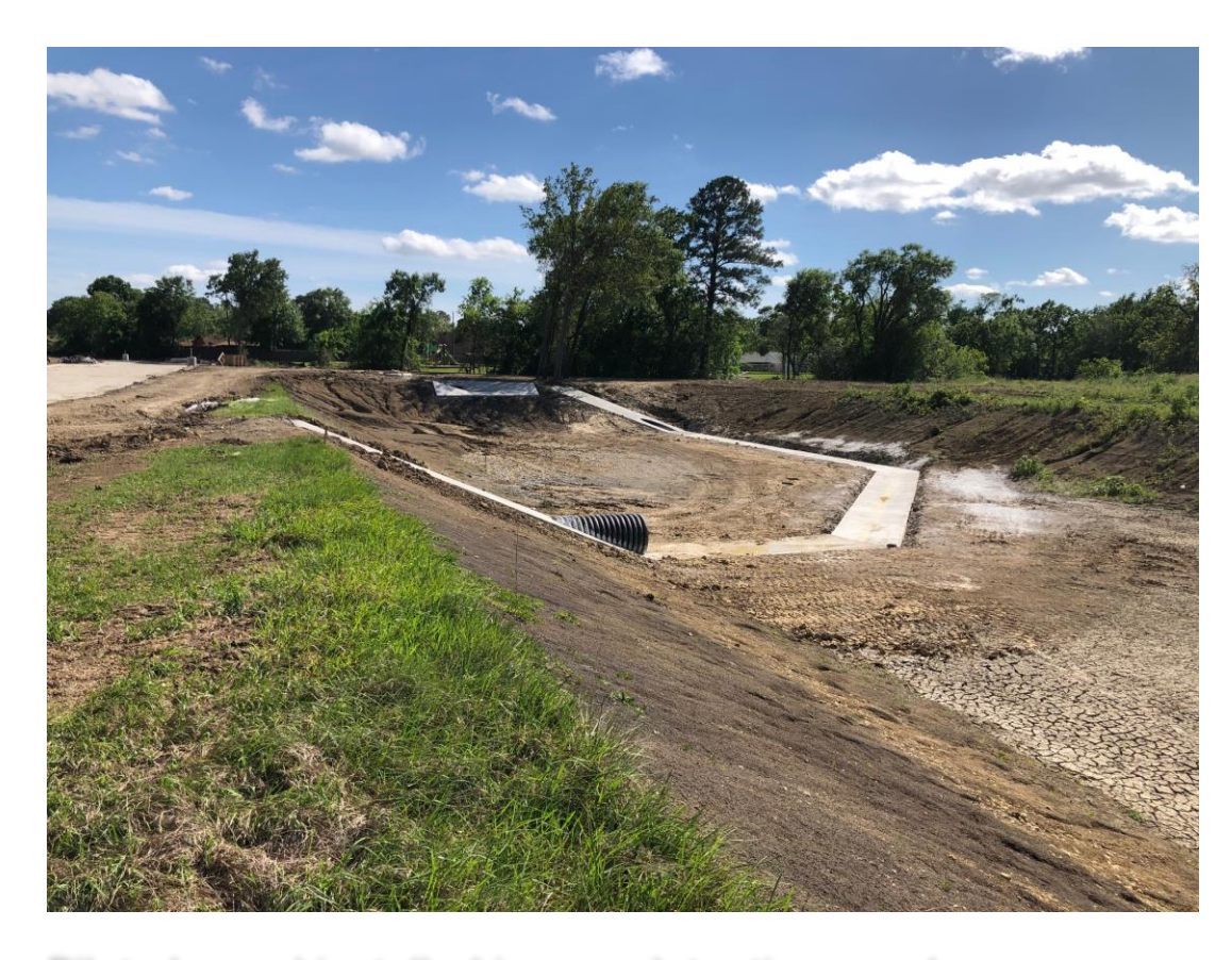
Pilot channel installed in new detention pond