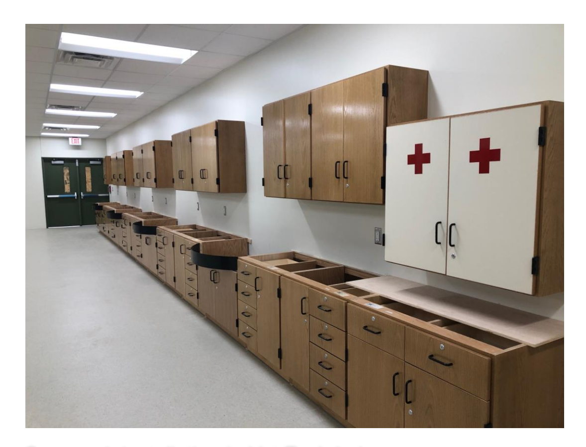
Casework installation in Vet Tech Lab