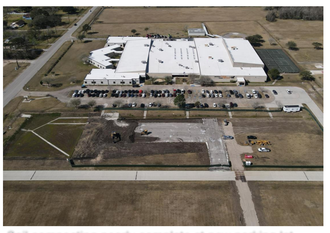
Soil compacting nearly complete at new parking lot