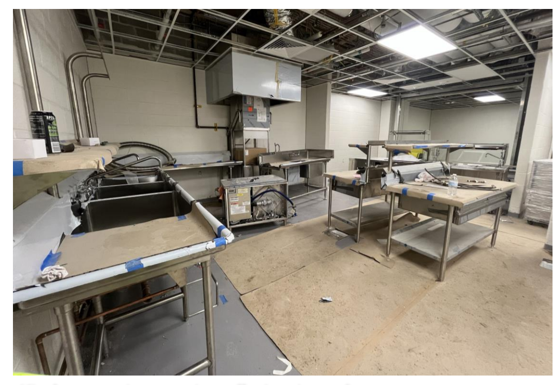
Kitchen equipment installation is underway