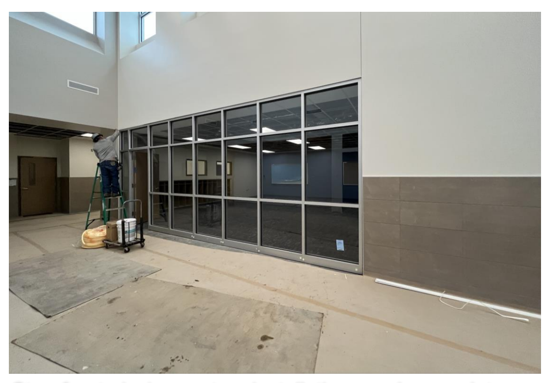
Storefront glazing system installation nearly complete