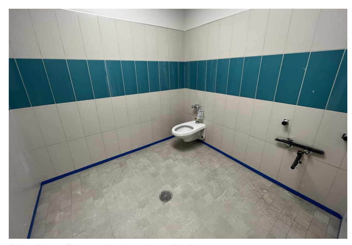
Plumbing fixtures being installed in restrooms