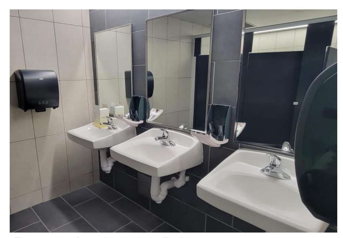
Fixtures and partitions installed in restrooms