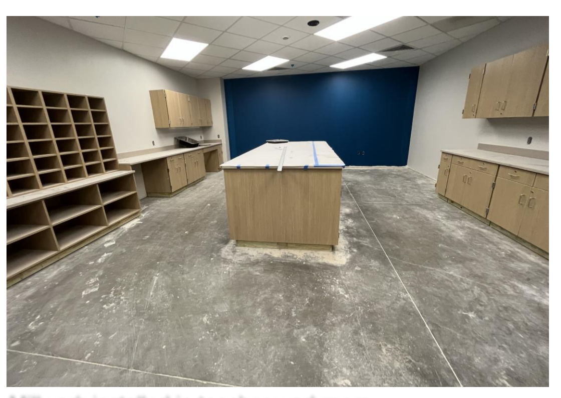
Millwork installed in teacher workroom