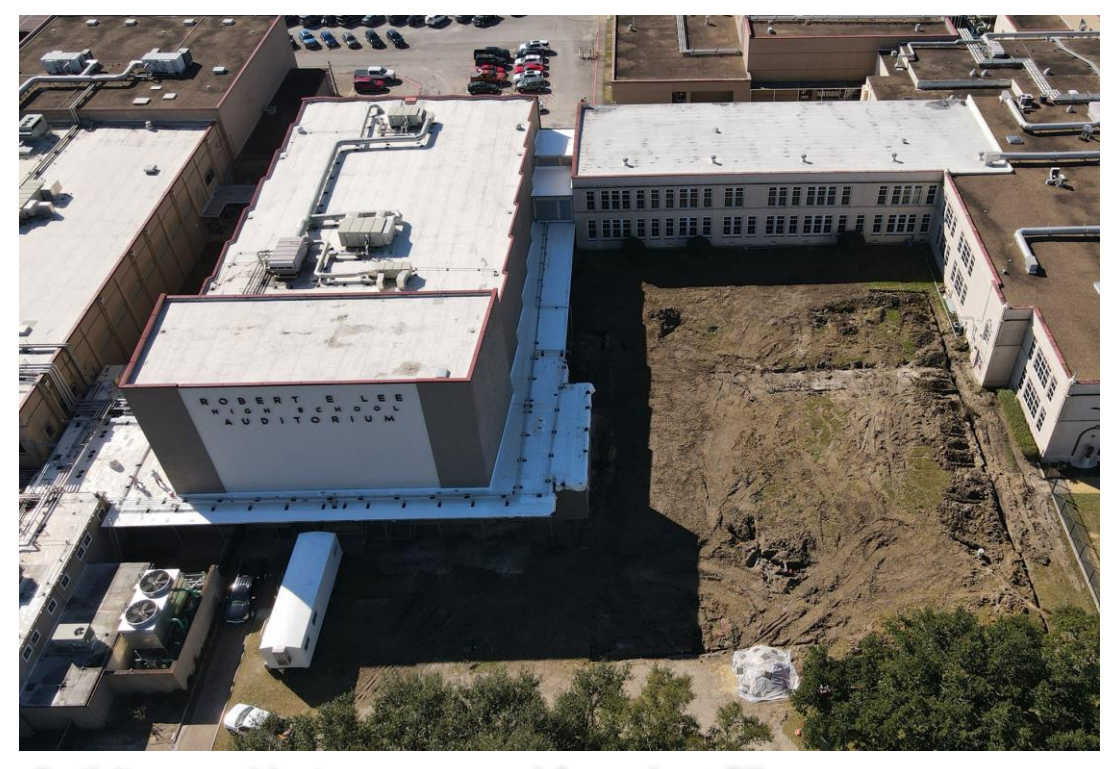
Building pad being prepared for select fill