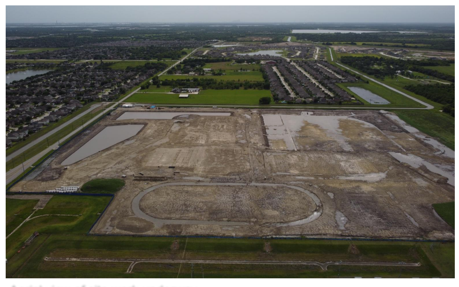
Aerial view of site work underway