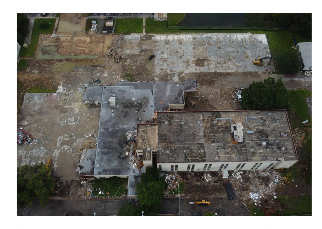
Demolition and abatement of rear medical building is in progress