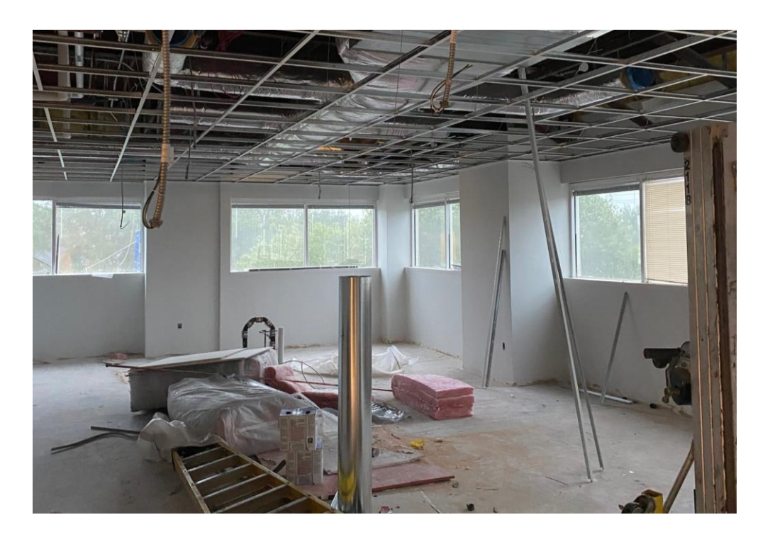
Metal framing & gypsum install is complete at the second floor, ceiling grid installation is underway