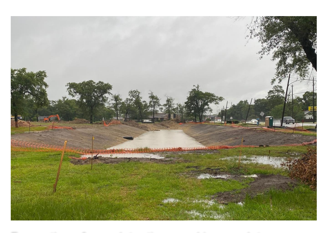
Excavation of new detention pond is complete