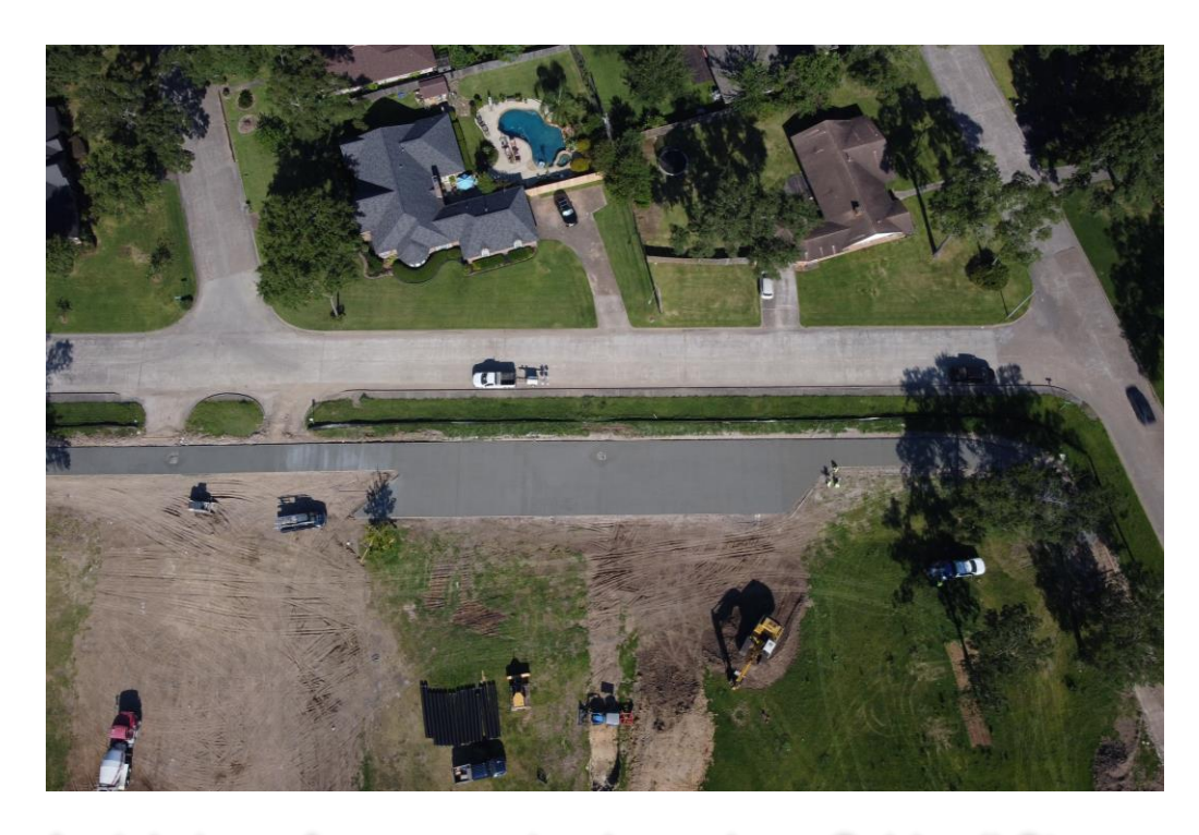
Aerial view of new queuing lane along Caldwell St.