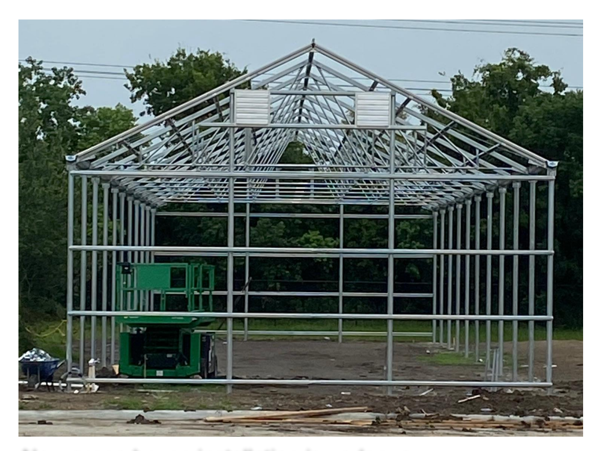
New green house installation is underway