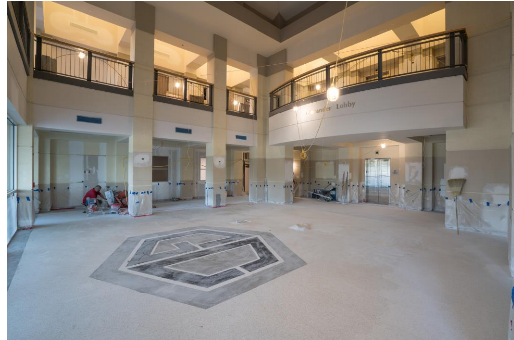
Terrazzo flooring installation is being finalized, final interior painting yet to be complete