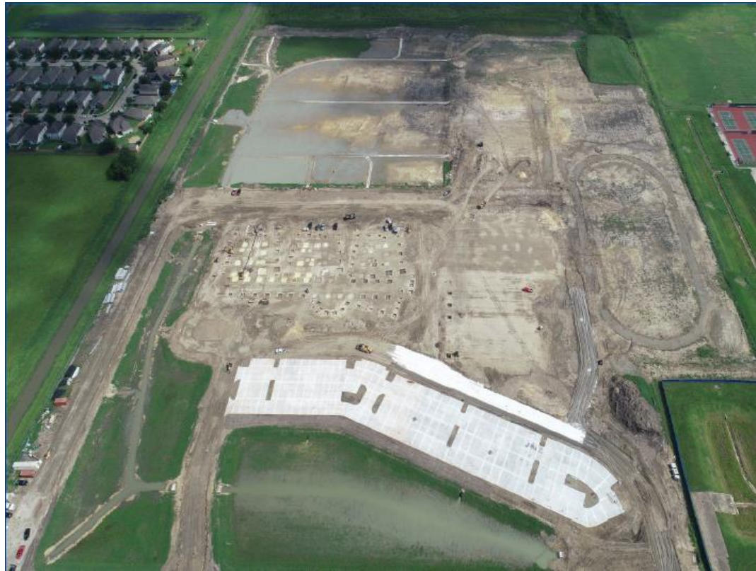
Aerial view of site: Parking lot poured, concrete prep work underway for bus and parent lanes