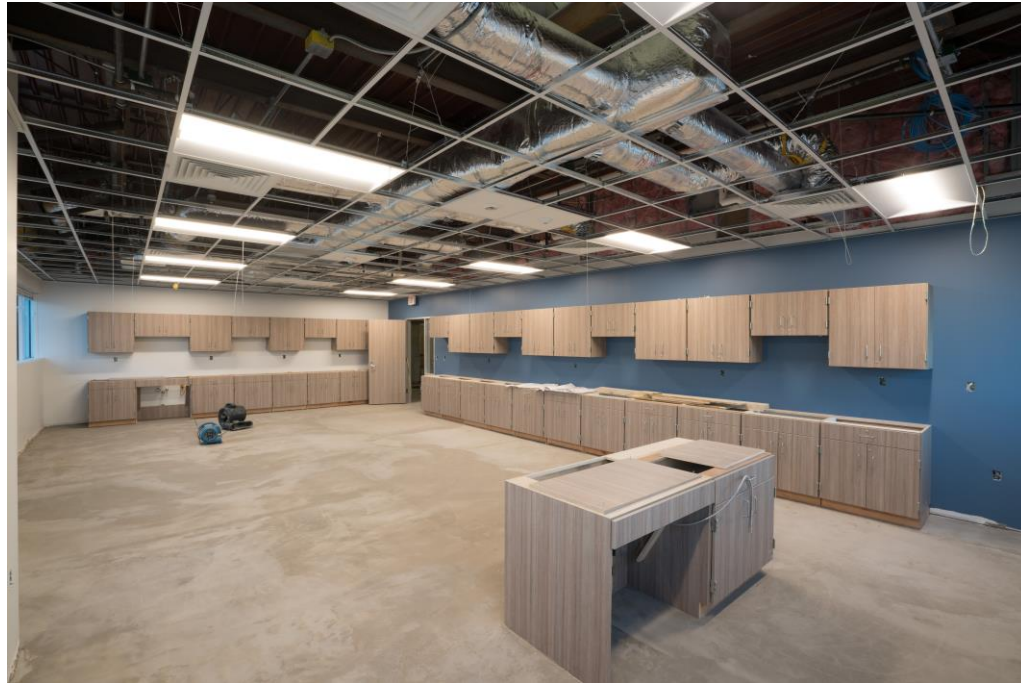
Floors are being prepped for vinyl flooring, millwork installation is underway