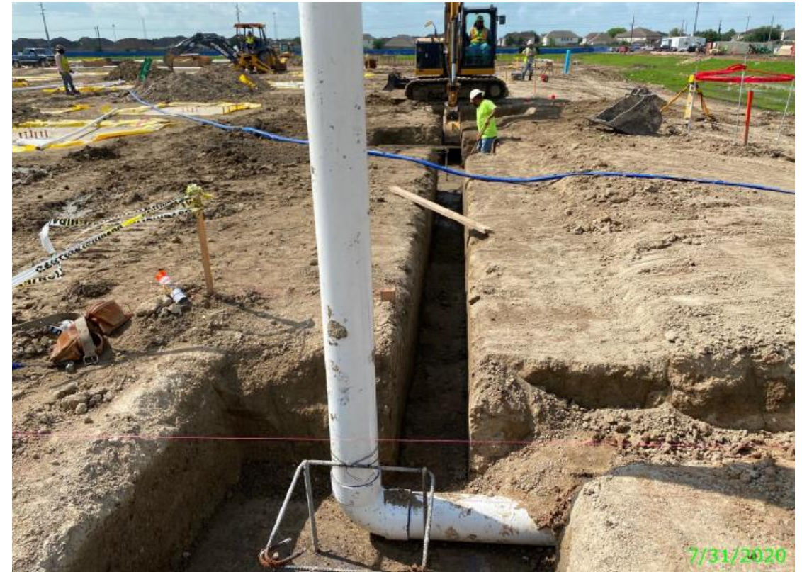
Foundation footing installation underway, and underground plumbing system in progress