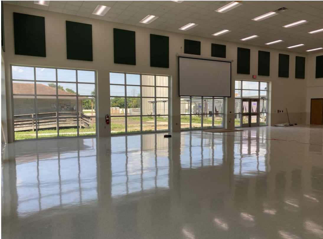
New cafeteria dining area