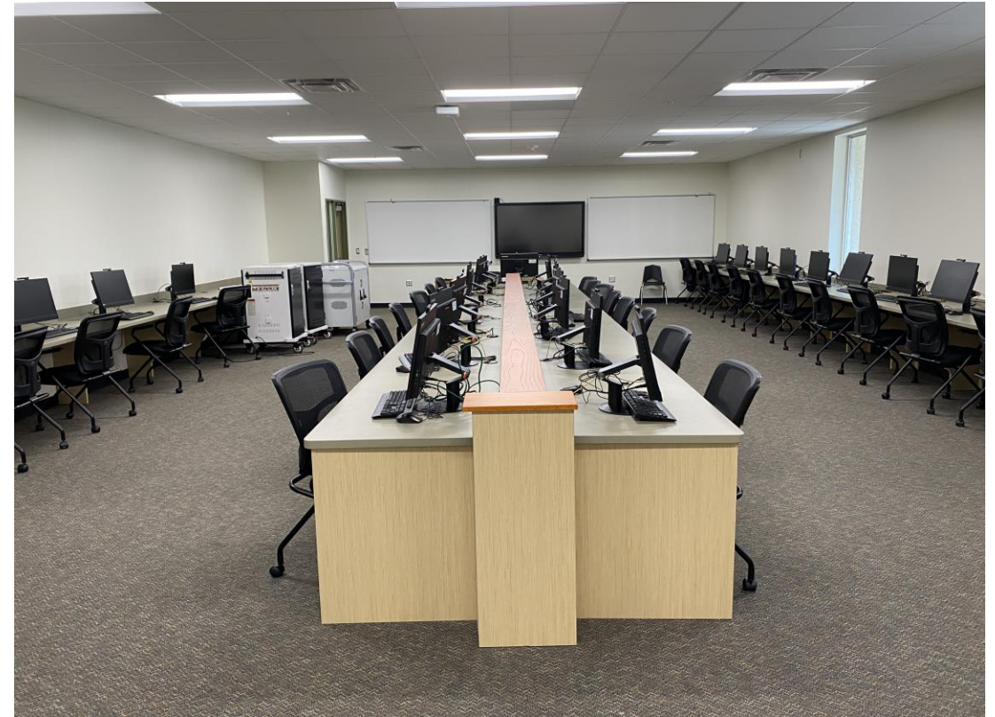
New computer lab in the West Building