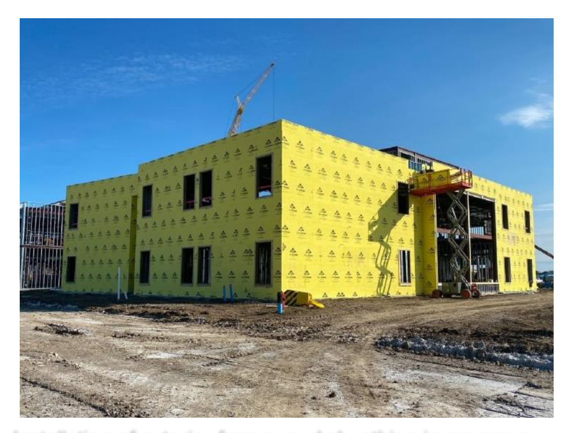
Installation of exterior frames and sheathing in progress