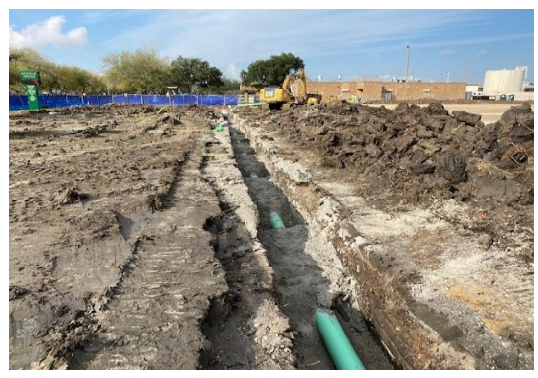
Underground site utility work is underway