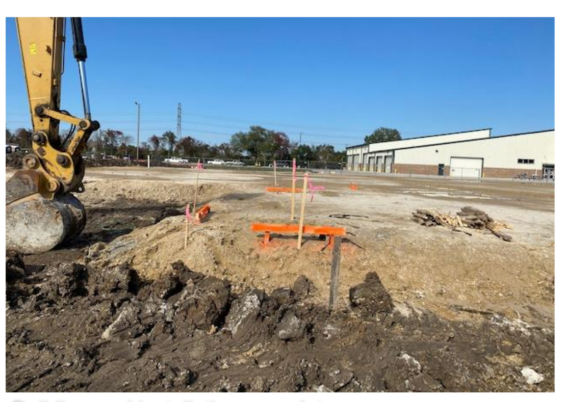
Building pad installation complete