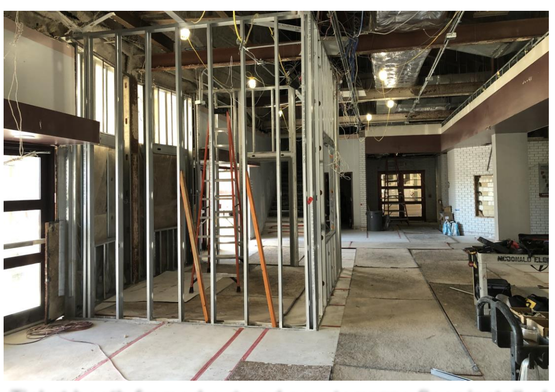
Ticket booth framed out and new terrazzo floor installed