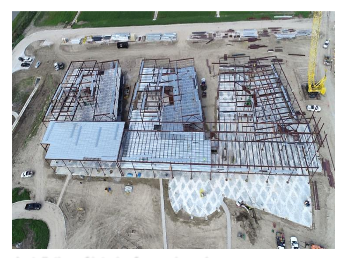
Installation of interior frames is underway