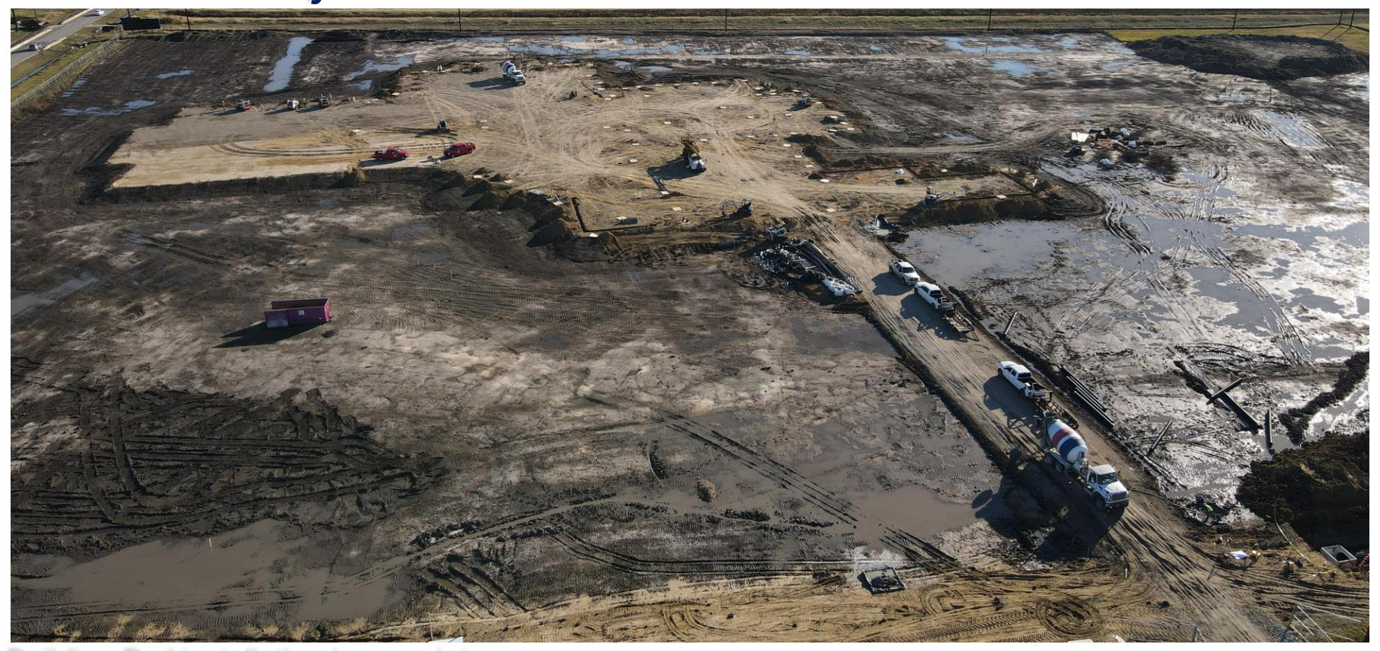
Building Pad installation is complete