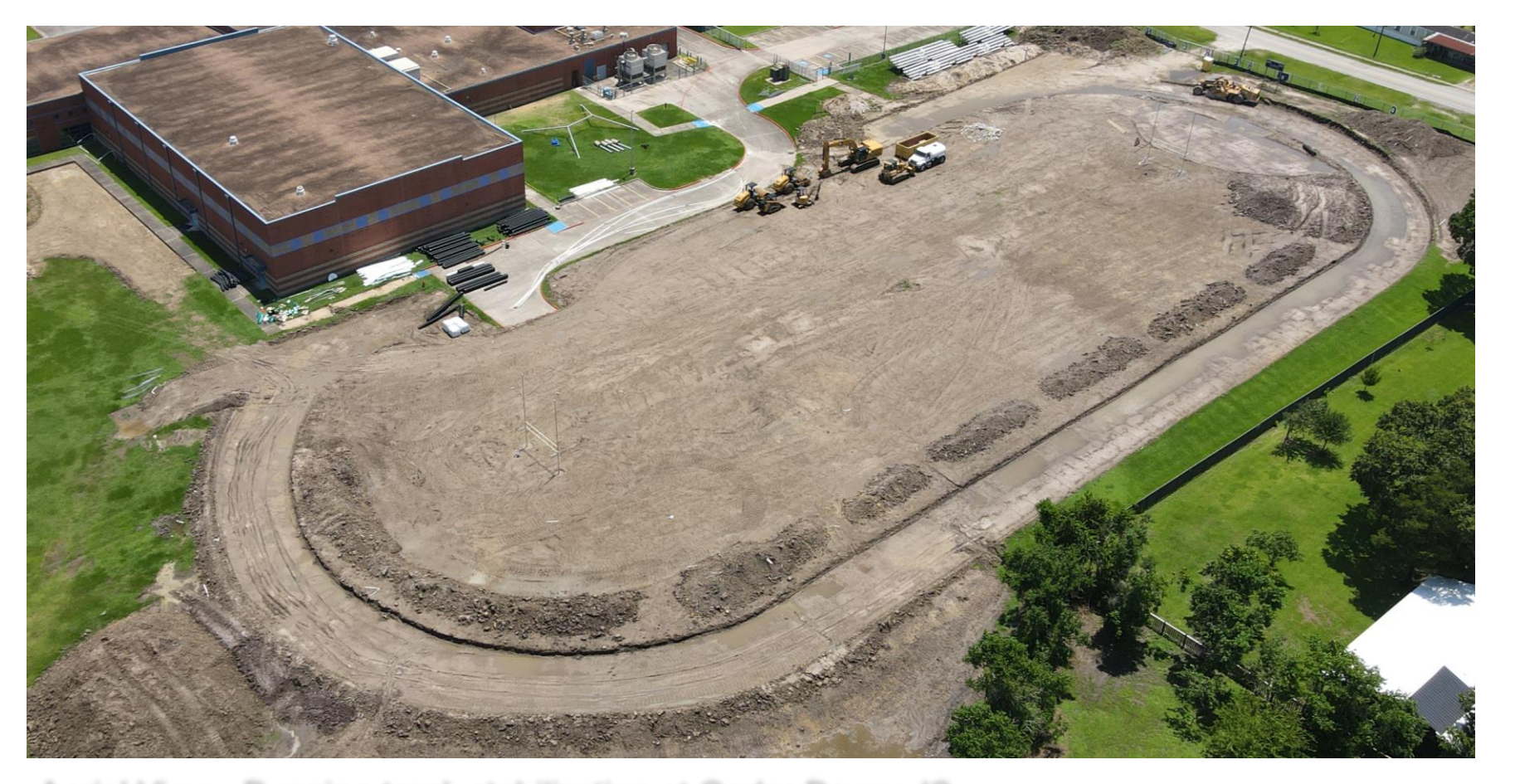
Aerial View - Running track stabilization at Cedar Bayou JS