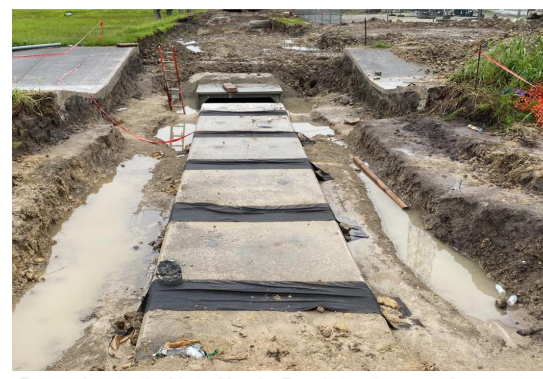
Box culverts tied into Harris Co. detention pond