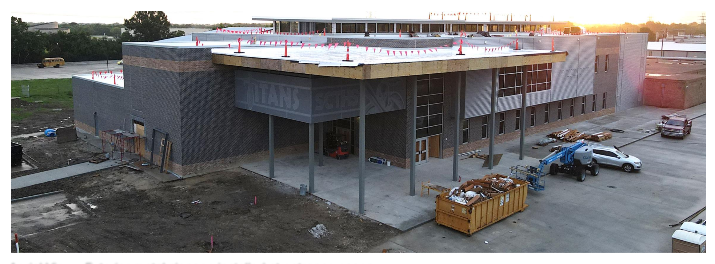
Aerial View - Exterior metal signage installed at entrance canopy