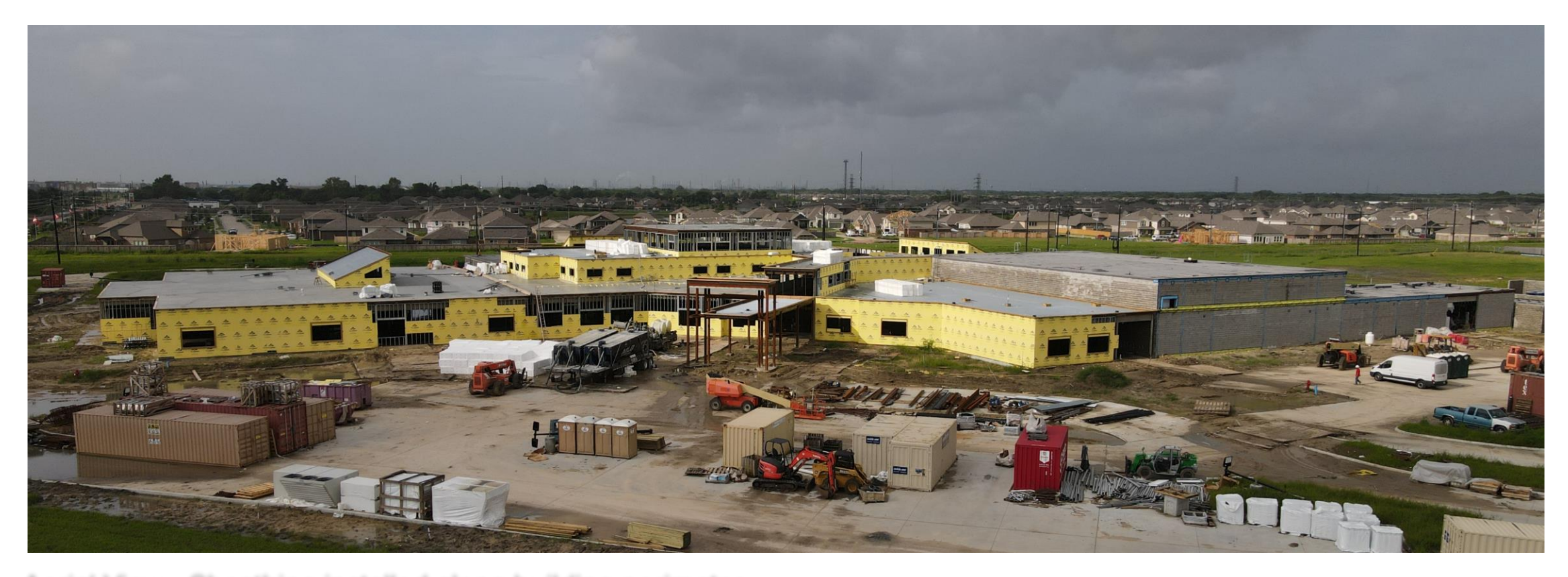
Aerial View - Sheathing installed along building perimeter