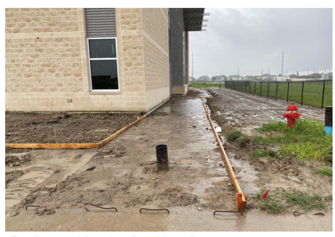
Grading and forming for sidewalks