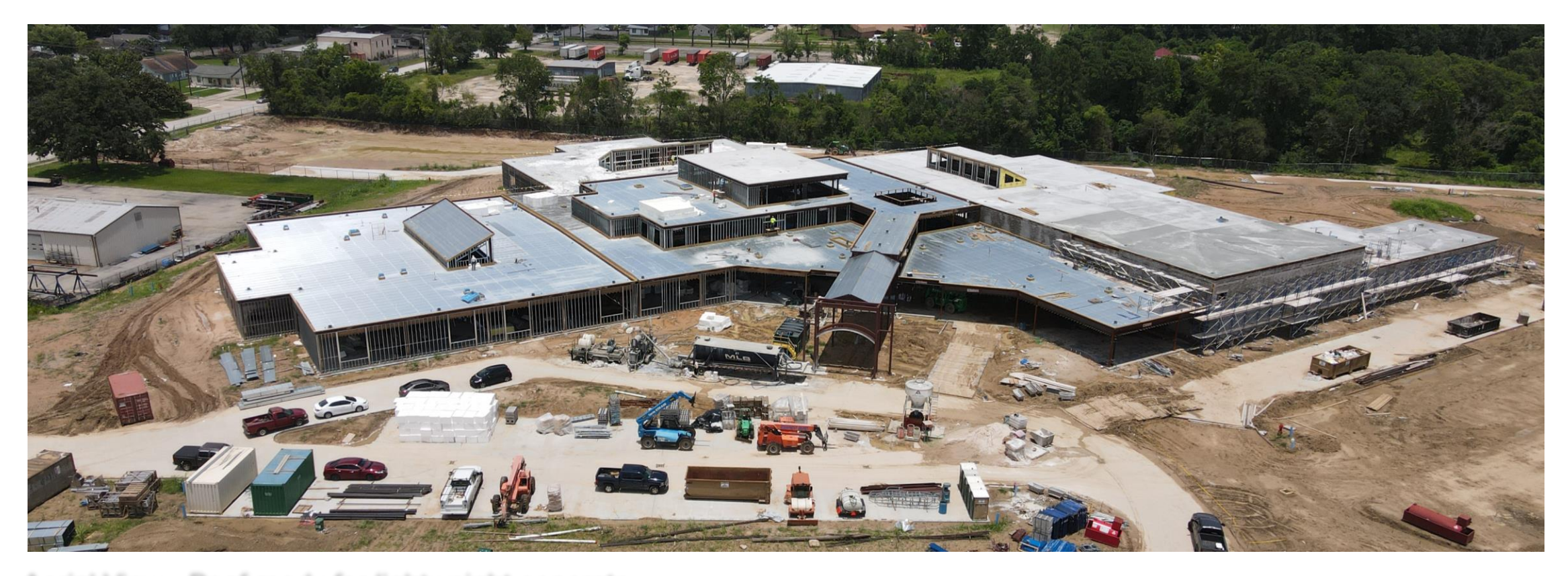
Aerial View - Roof ready for lightweight concrete