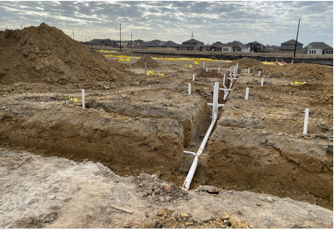
Plumbing rough-in underway throughout entire building pad