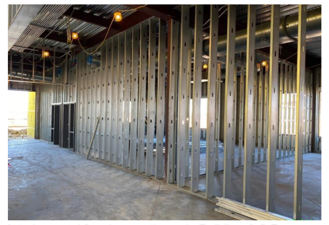
Interior metal framing continues in Building A & B