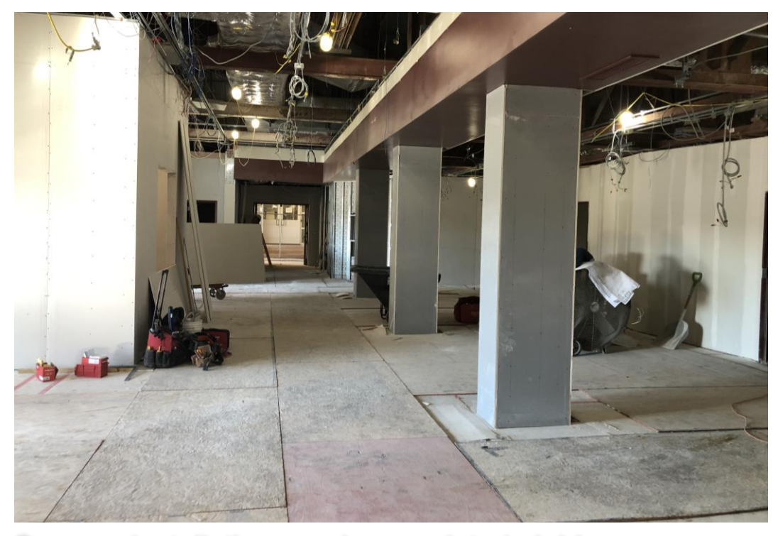
Gypsum installation nearly complete in lobby area