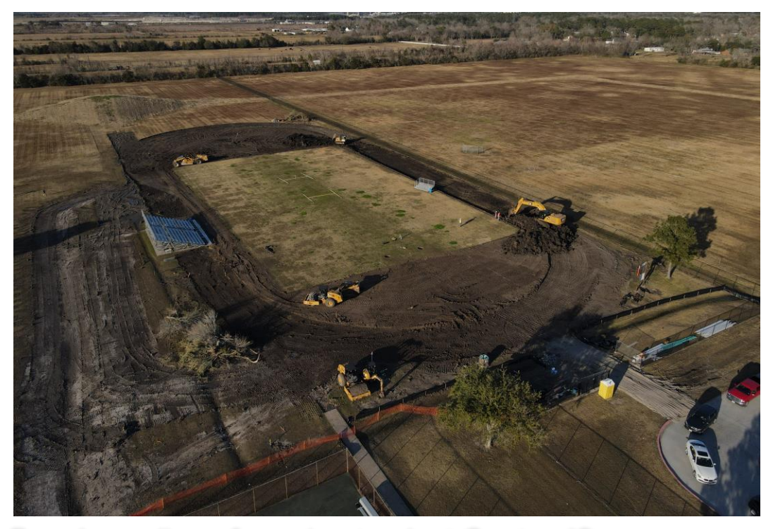
Rough grading of running track at Gentry JS