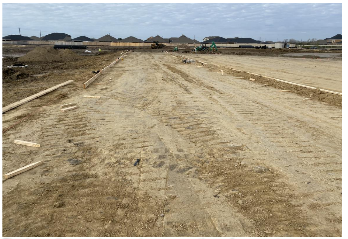
Final grading underway in preparation of concrete pour at parking lot