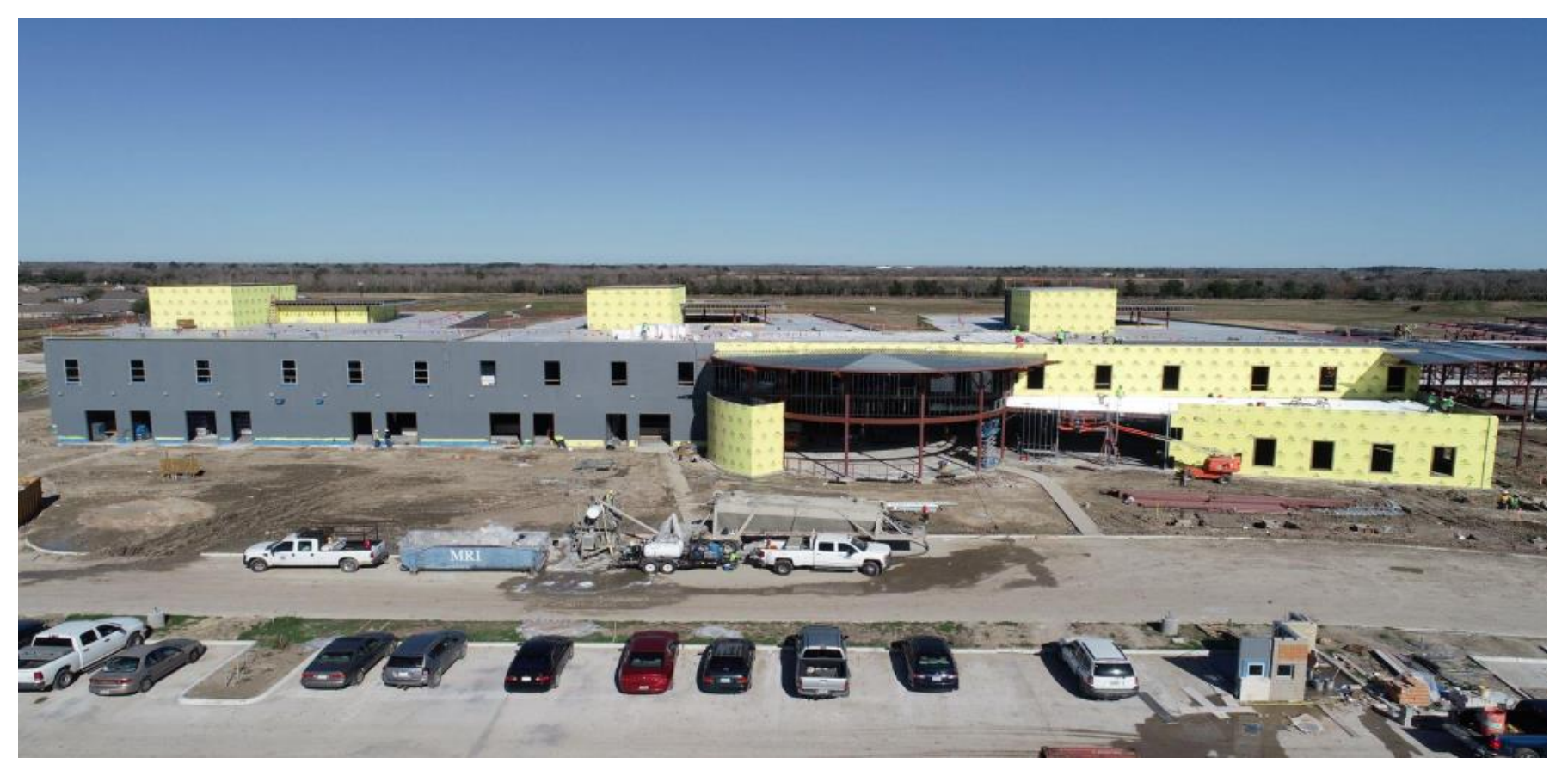
Installation of sheathing and waterproofing progresses