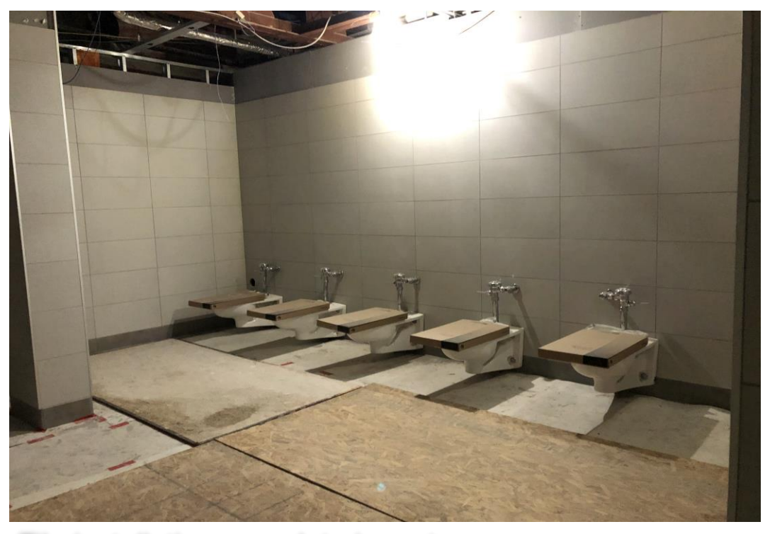
Tile installation complete in restrooms