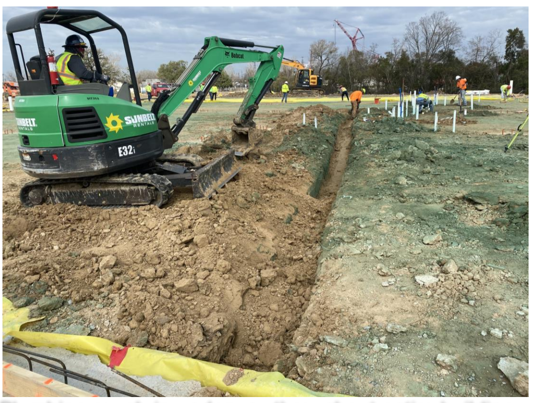
Plumbing rough-in underway throughout entire building pad