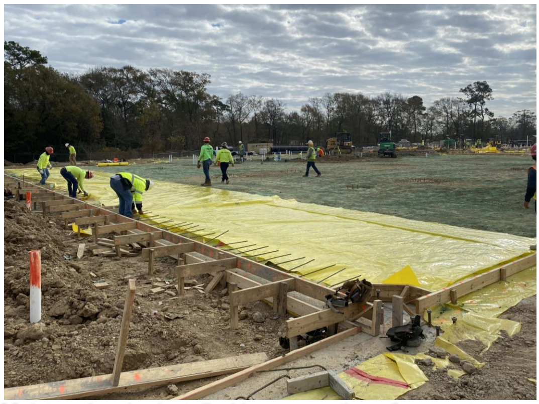
Moisture barrier installed in preparation of concrete pour at Area D of building pad