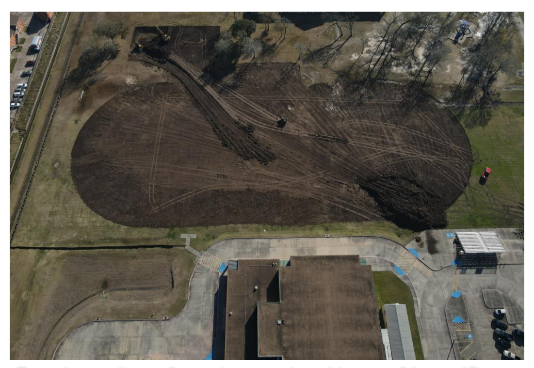
Rough grading of running track at Horace Mann JS