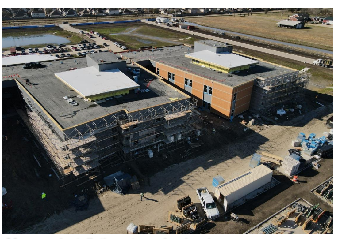
Masonry installation at academic wings