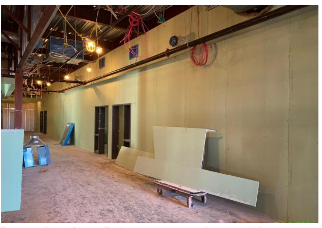
Gypsum board installation progresses along corridors