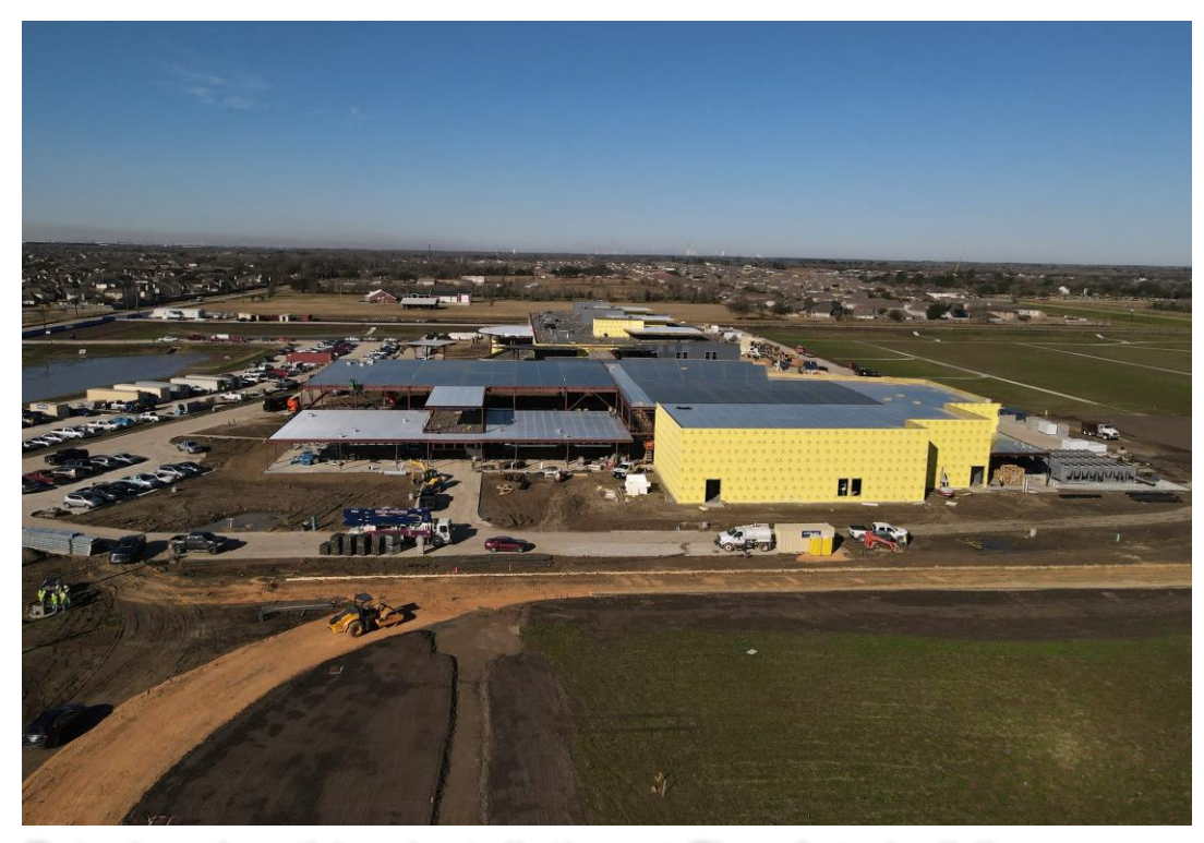
Exterior sheathing installation at Fine Arts building