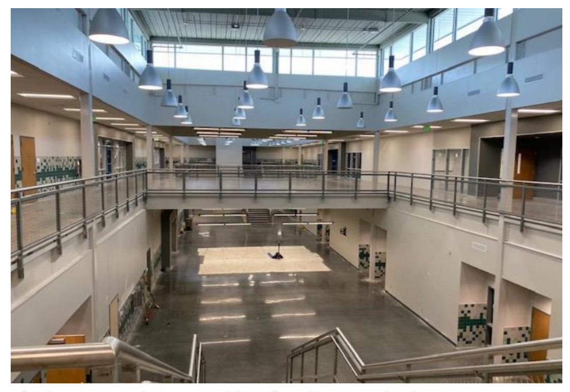
Atrium complete; awaiting furniture arrival