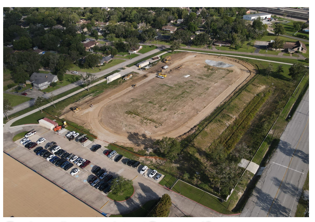
Track grading complete at Baytown JS