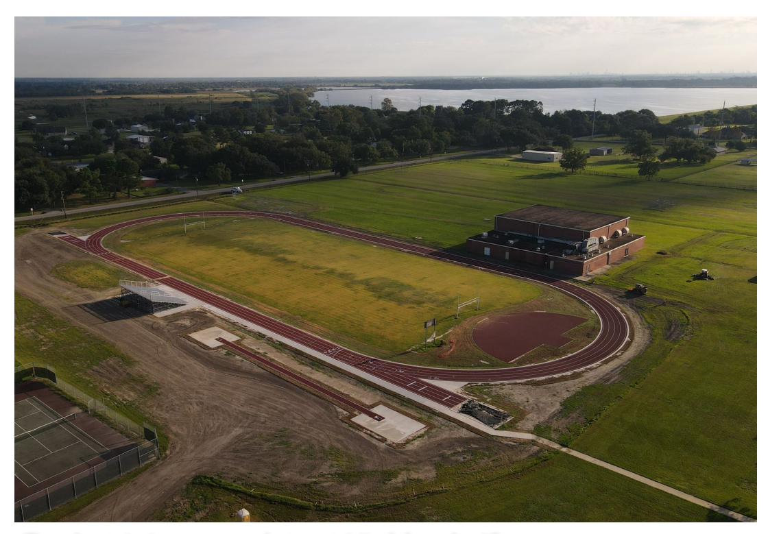
Track striping complete at Highlands JS