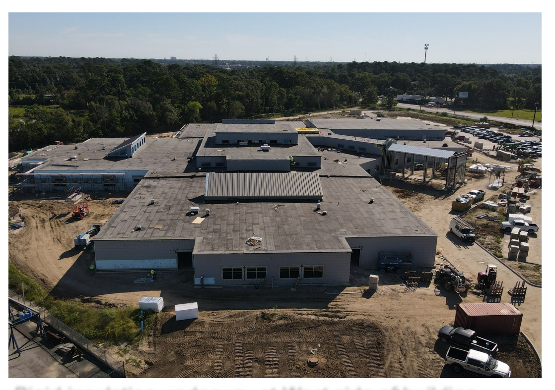
Rigid insulation underway at West side of building