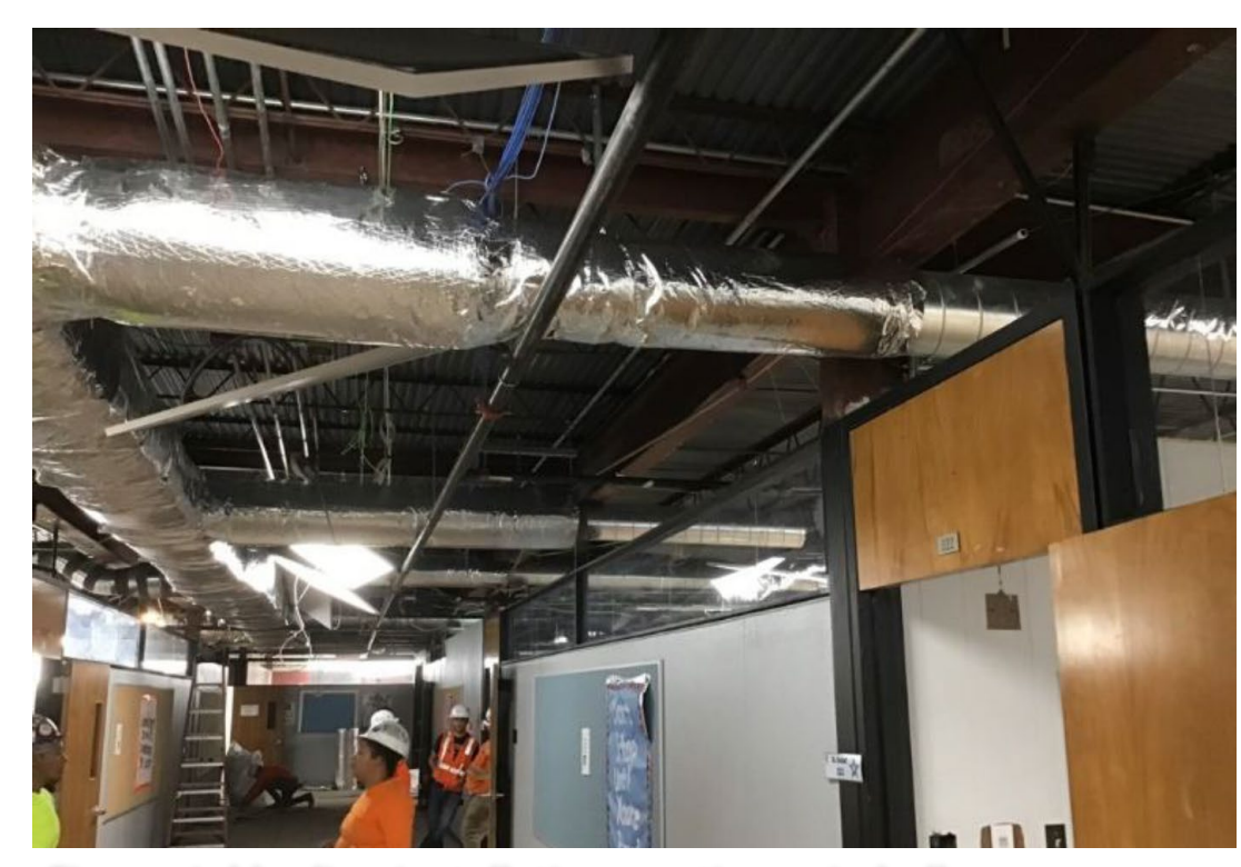
Fire sprinkler line installation continues in hallways