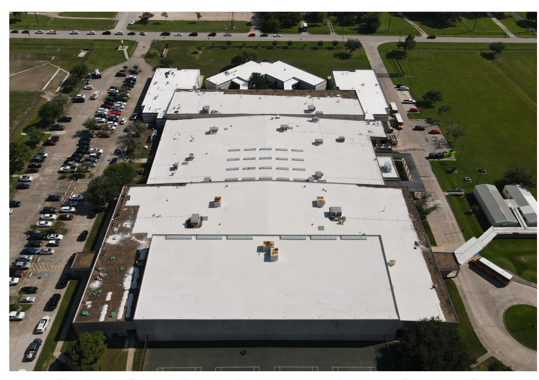
Installation of cap sheet almost complete at Gentry JS