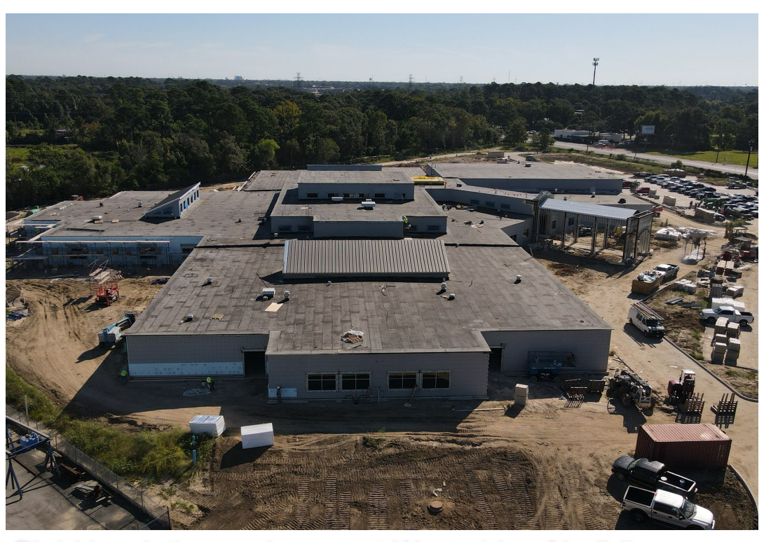
Rigid insulation underway at West side of building