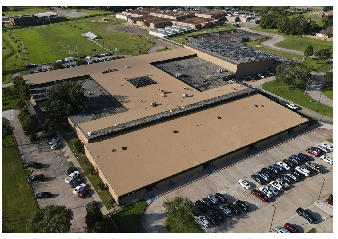
Installation of cap sheet almost complete at Baytown JS