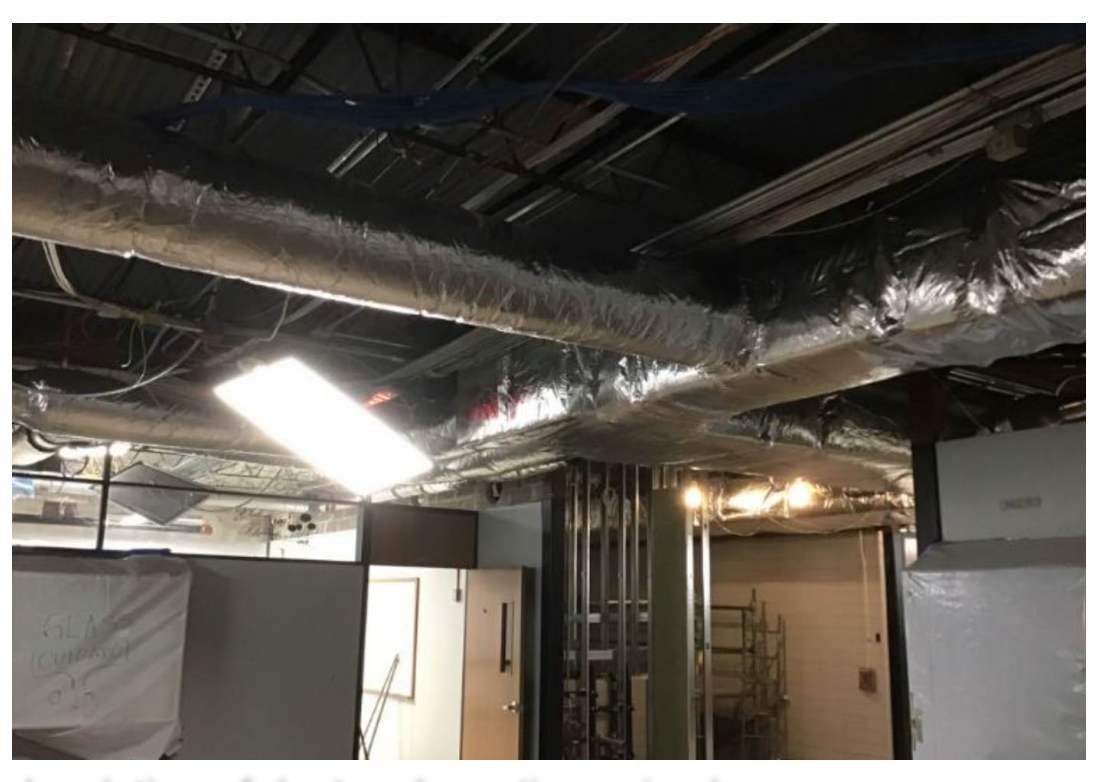
Insulation of ductwork continues in classrooms