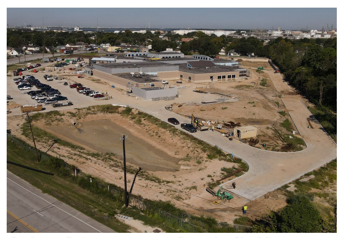
Brick installation progresses at East side of building