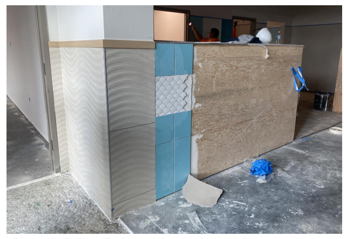
Ceramic tile installation underway in corridors