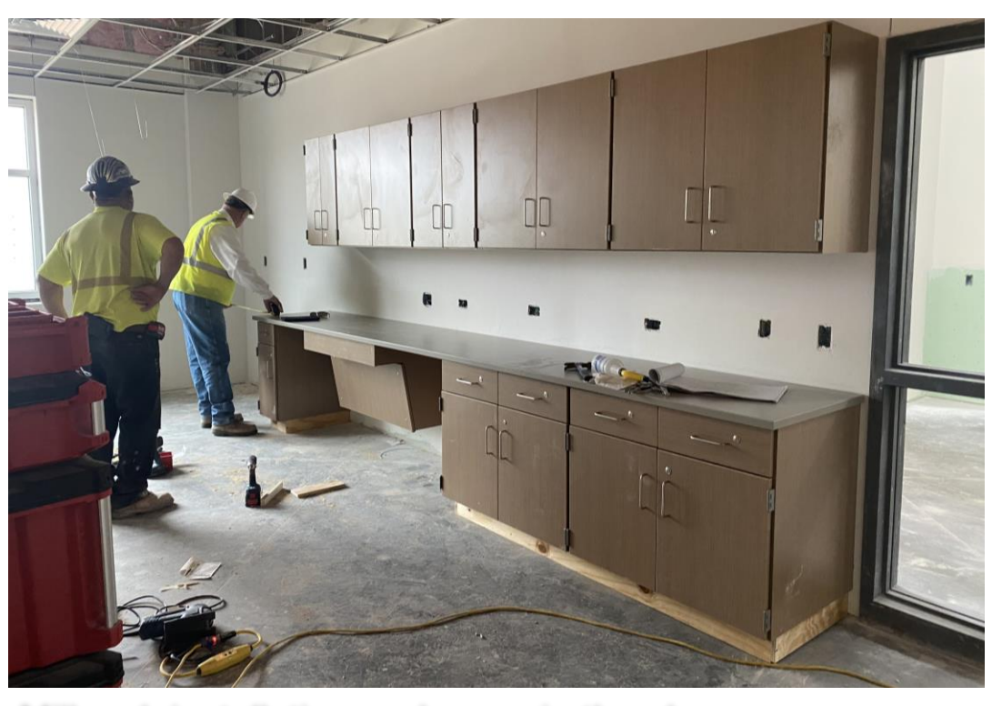
Millwork installation underway in the classrooms