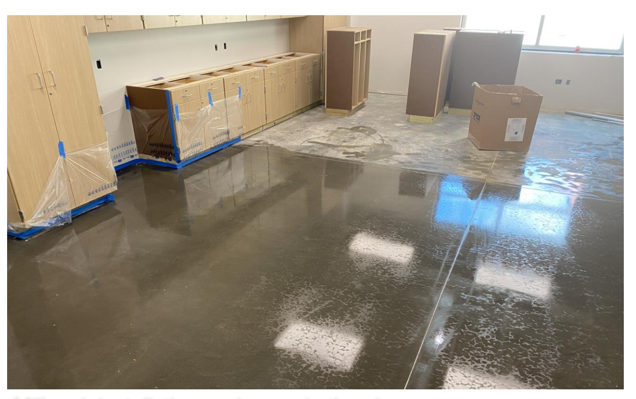
Millwork installation underway in the classrooms