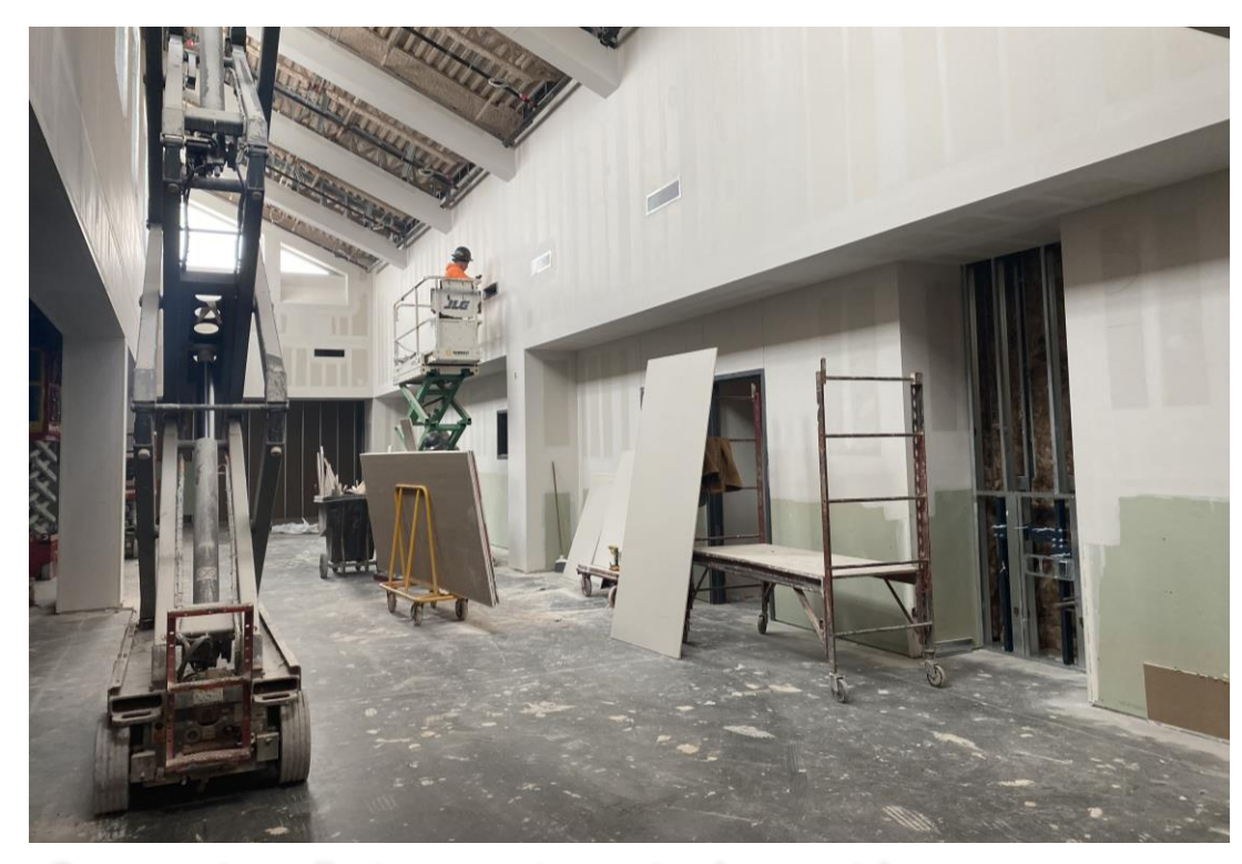
Gypsum installation continues in the corridors