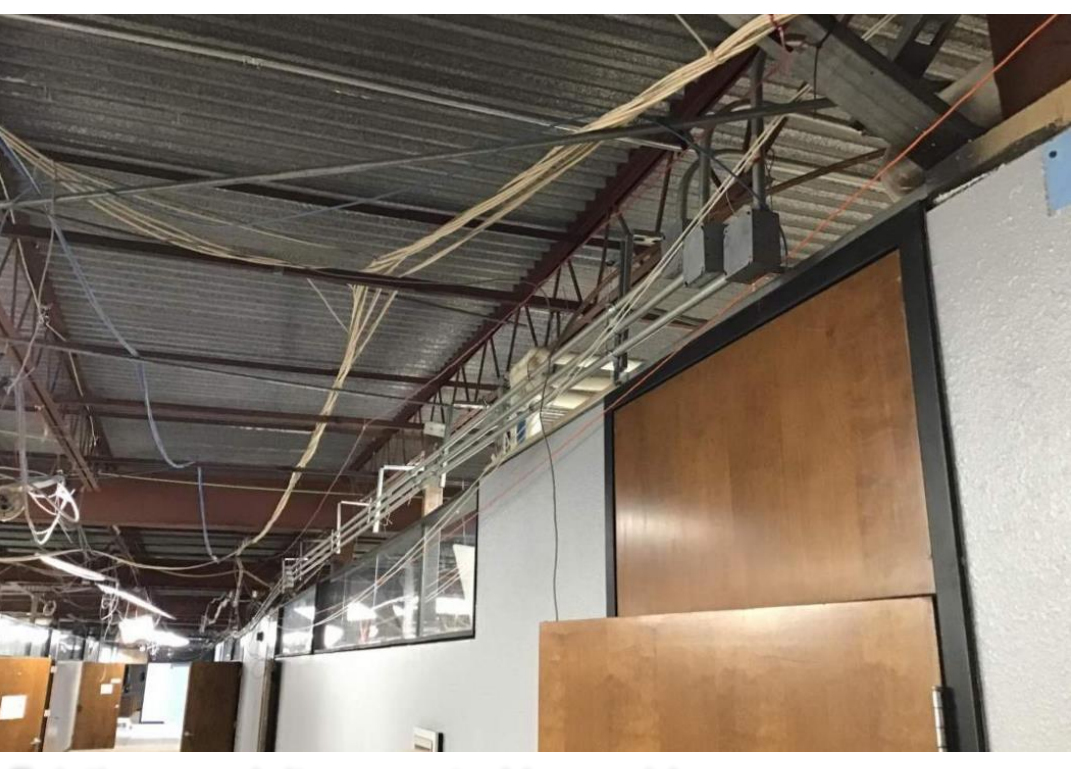
Existing conduit supported in corridor