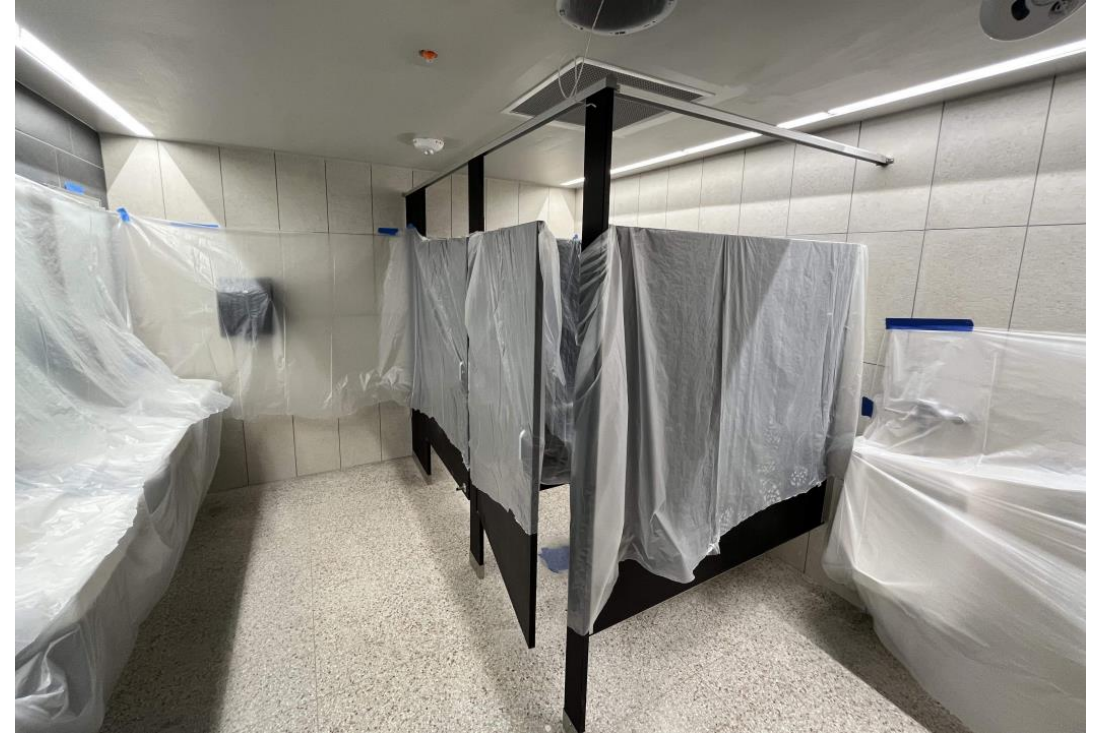
Toilet partitions installation complete in restrooms