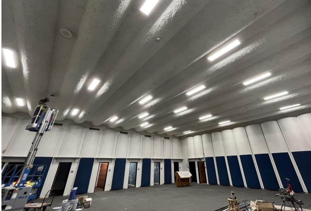
Sprinkler heads and speaker installation underway at the Band Hall