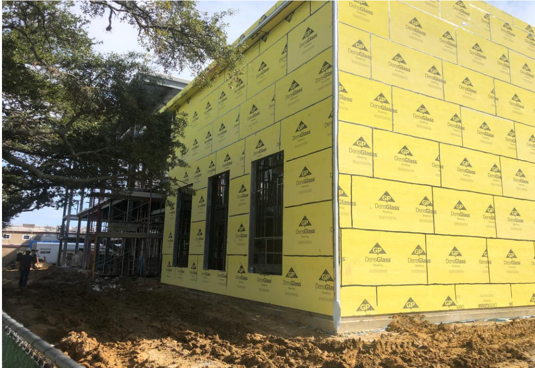
Exterior sheathing installation is underway at the Band Hall area at Lee High School