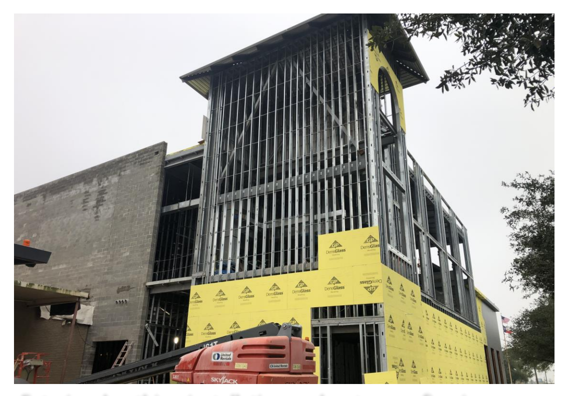
Exterior sheathing installation and waterproofing is underway at Lee High School