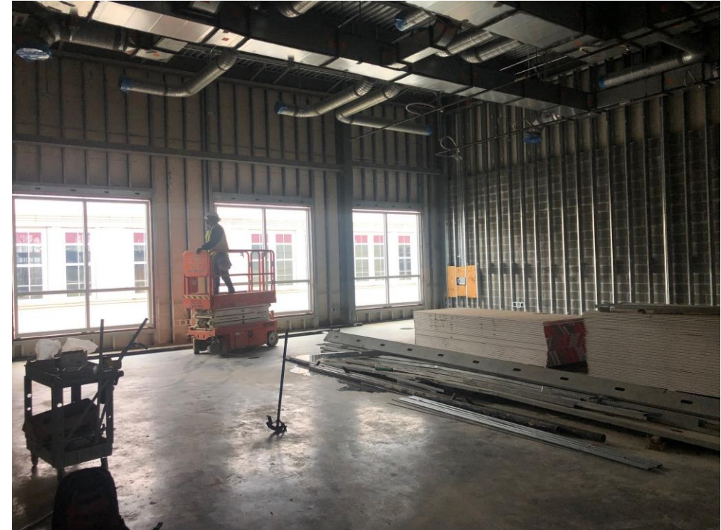
Metal stud framing complete at the 1 st and 2 nd floor at Lee High School