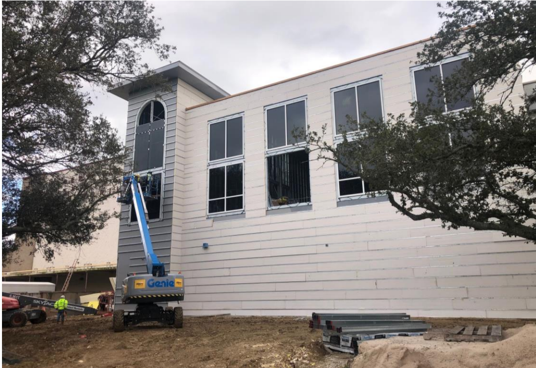
Installation of windows and exterior sheathing nearly complete at Lee High School