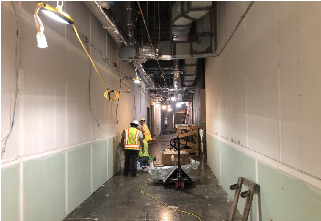
Gypsum board taping and floating is ongoing