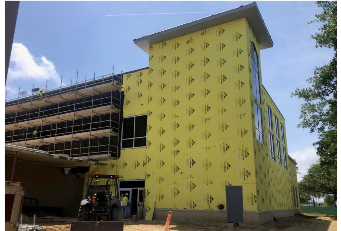
Weatherproofing of exterior continues at East facade