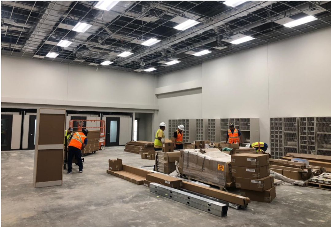
Installation of instrument storage units