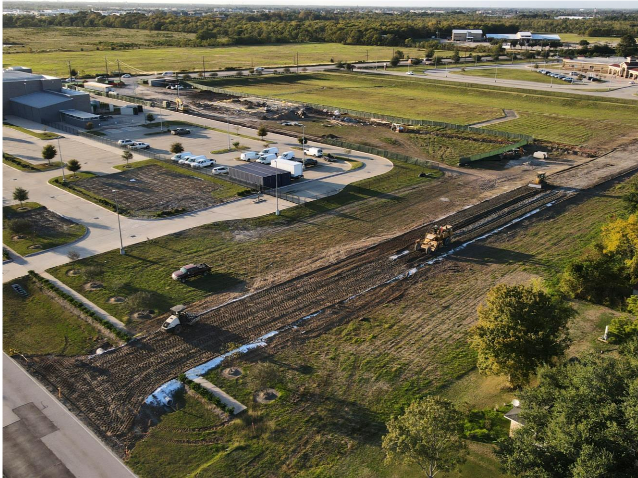
Aerial Site Image