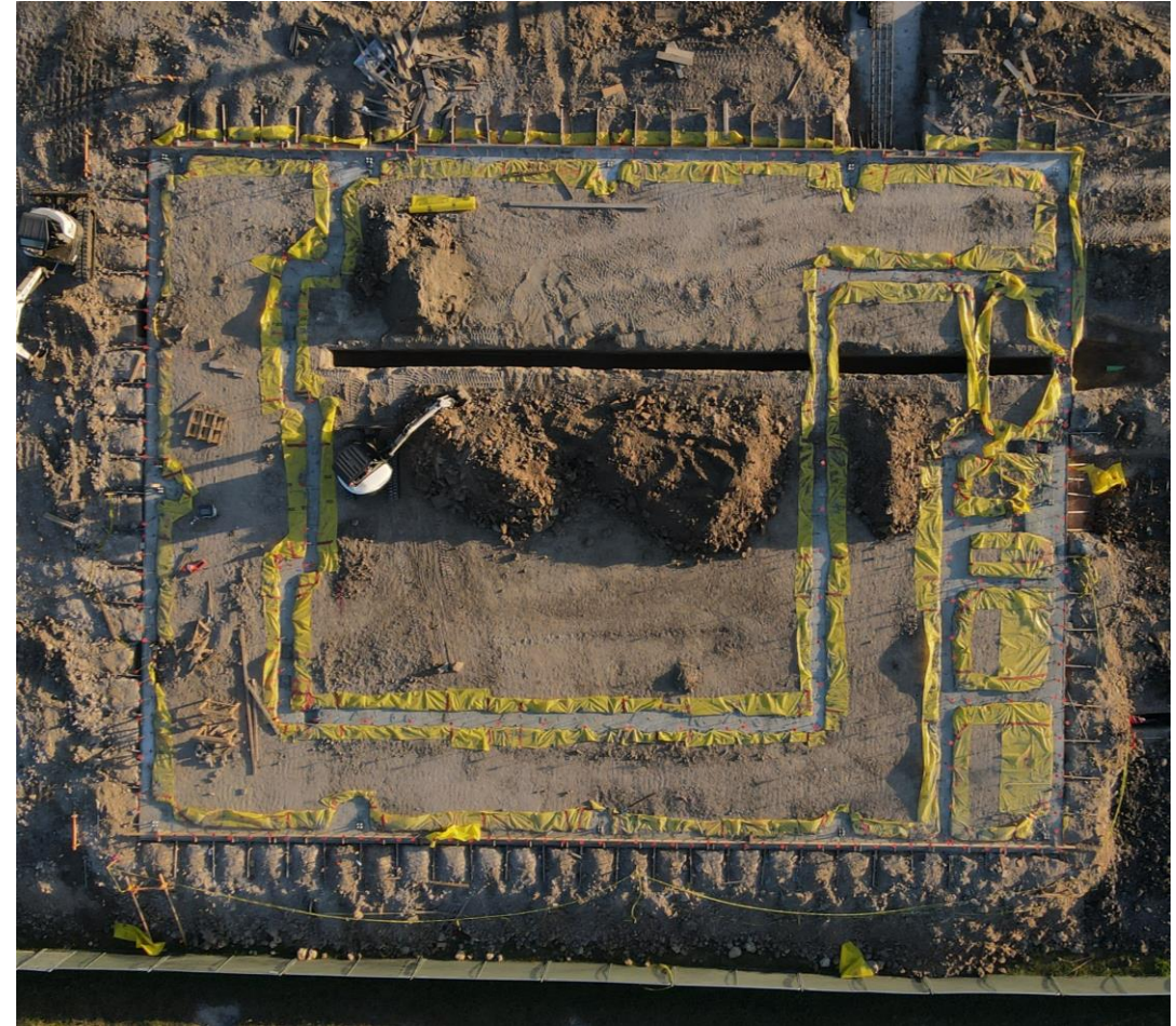
Aerial Building Pad Image