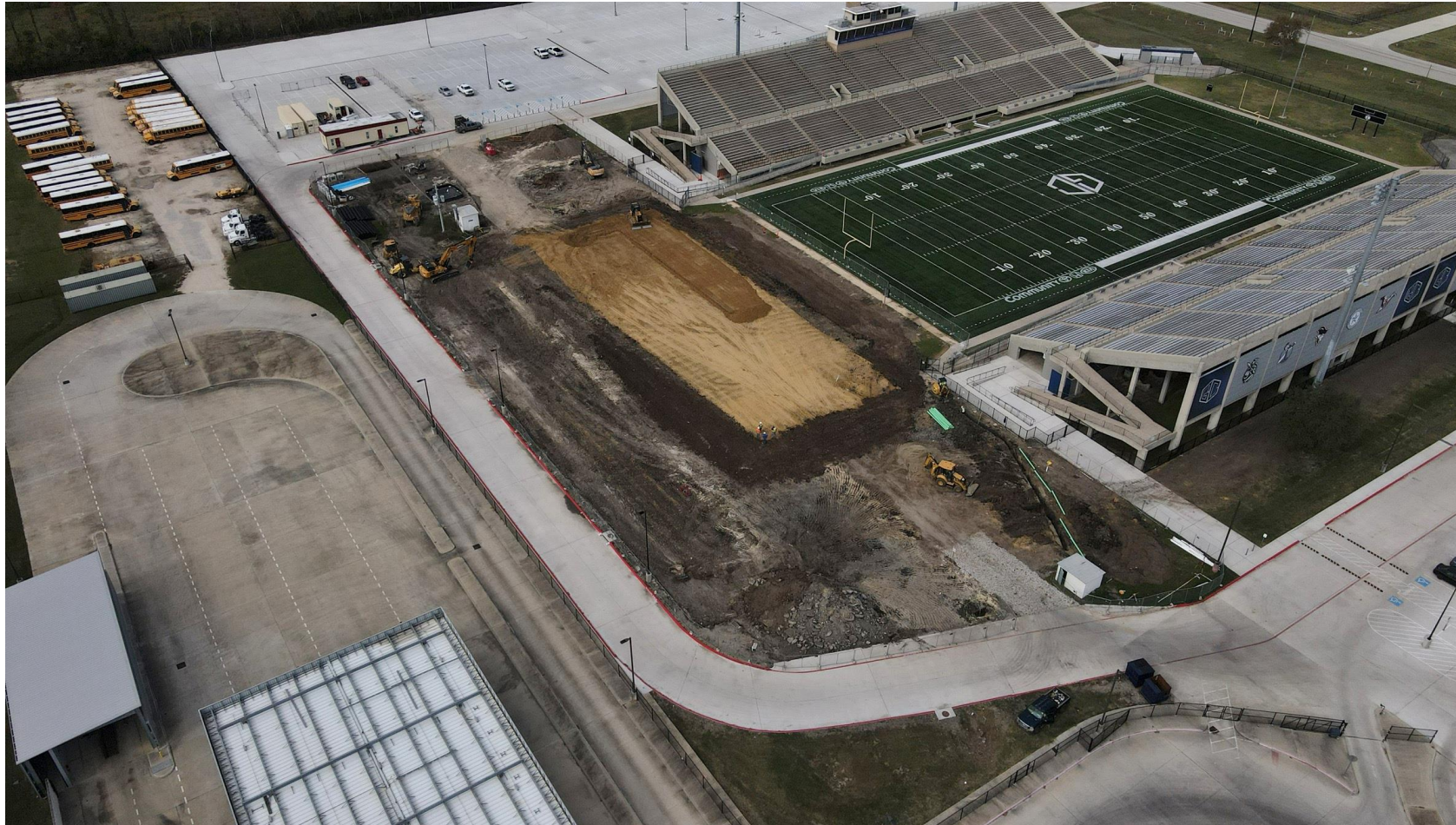
Aerial Site Image