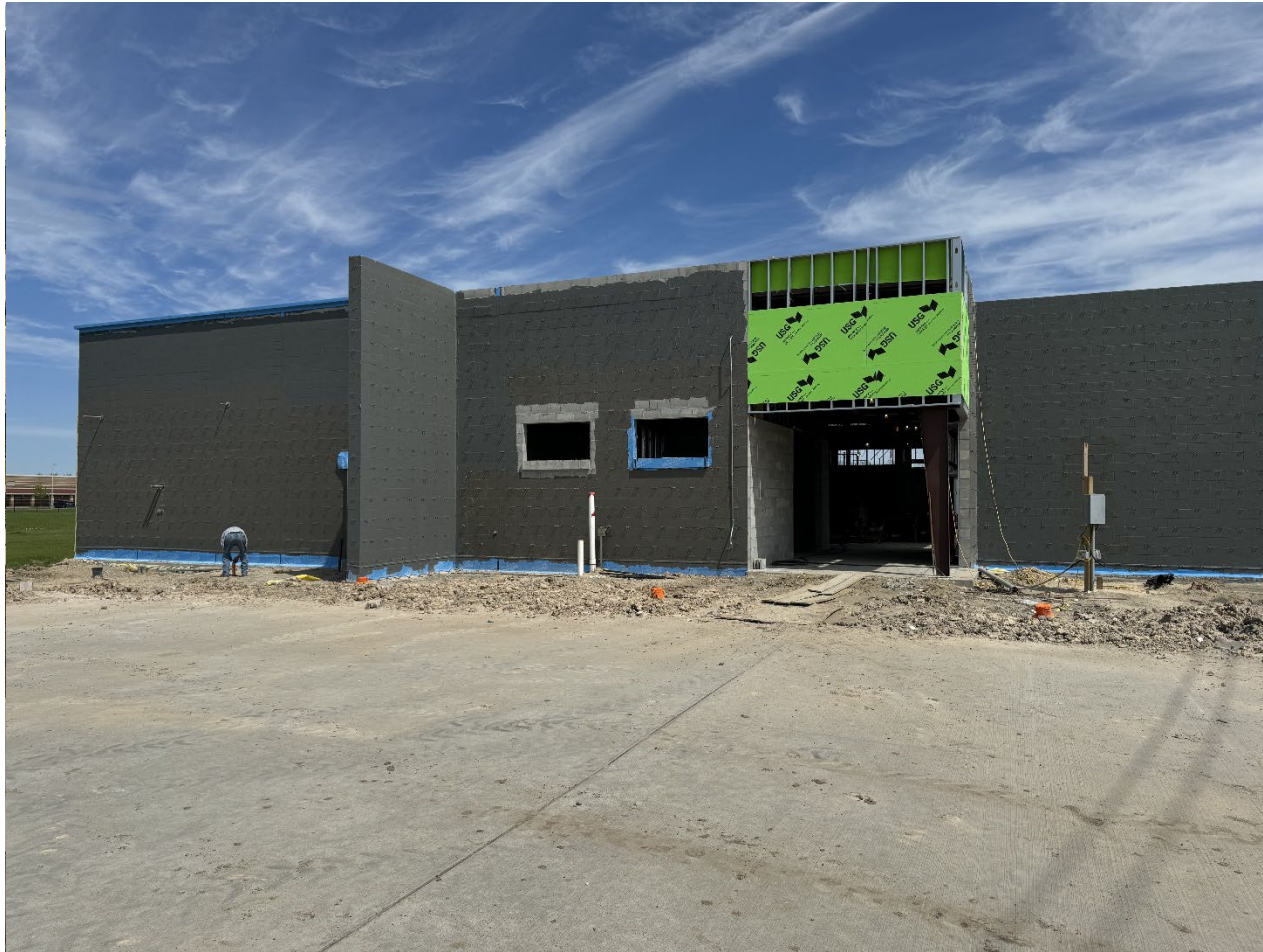
Front Façade - Waterproofing