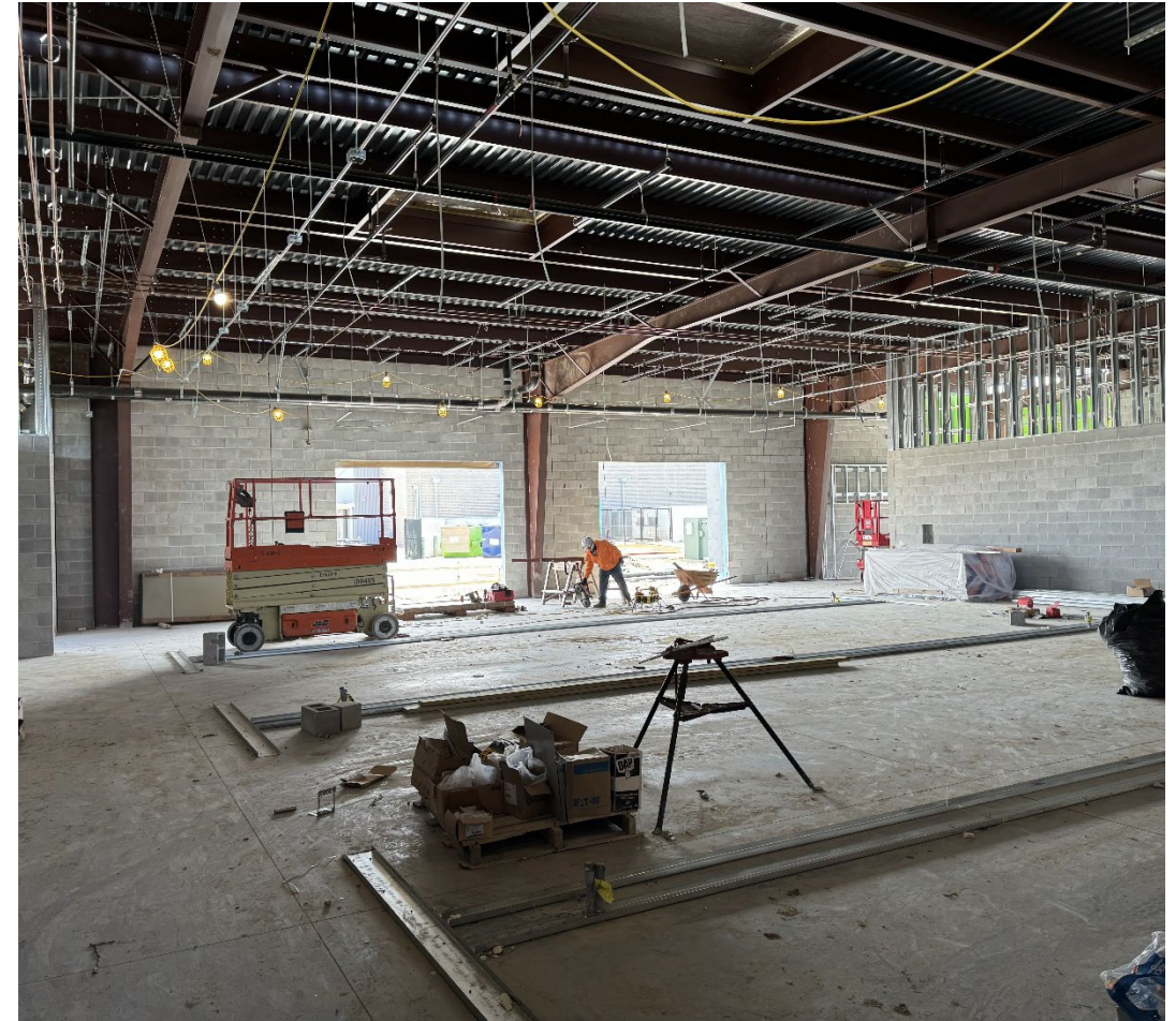
Interior workspace – MEP systems