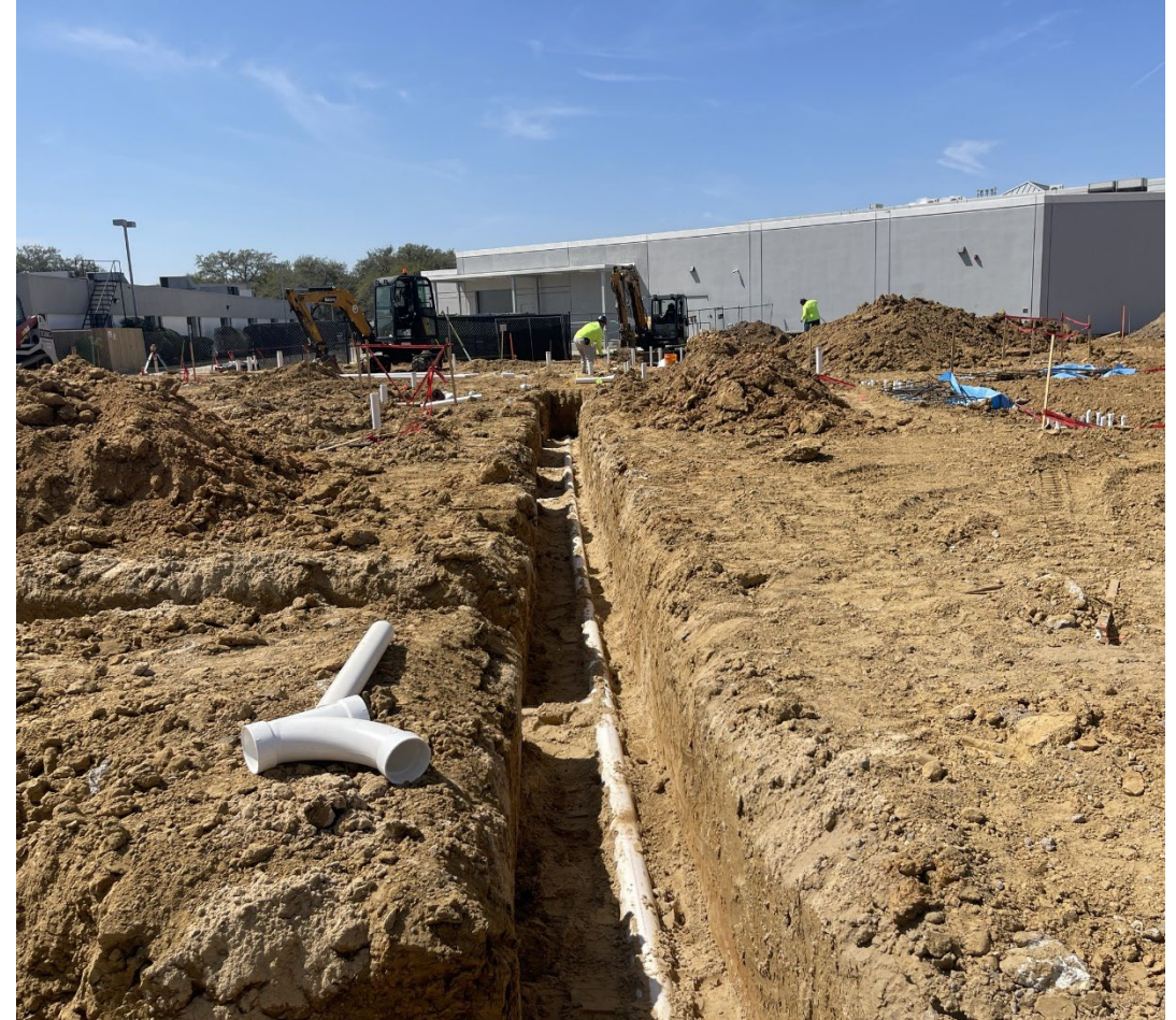
Sanitary Plumbing Rough-in underway