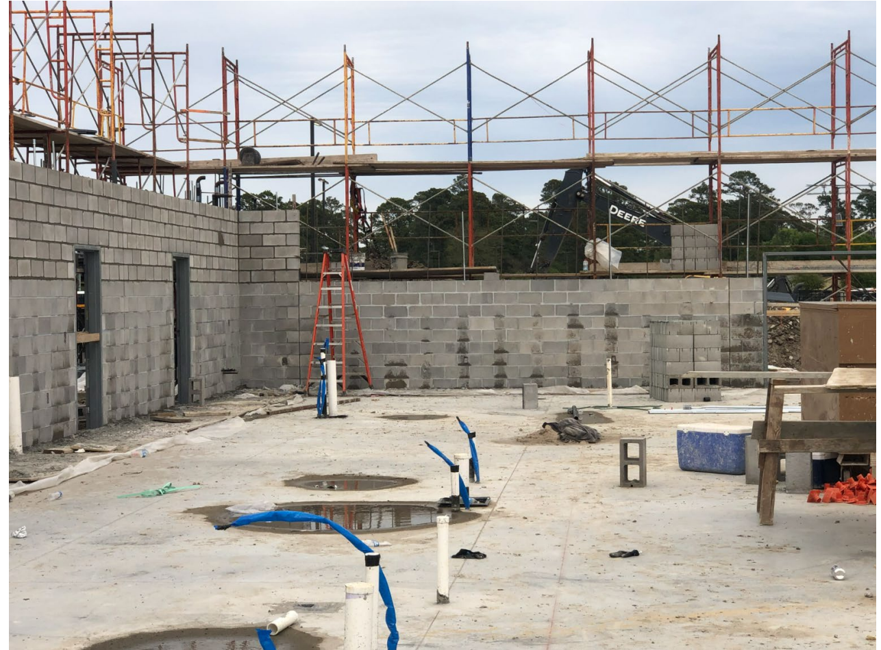
CMU Block Installation