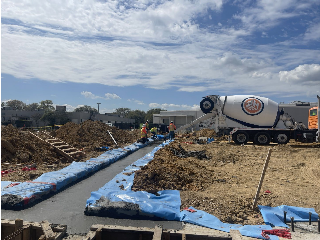
Concrete Placement of Grade Beams