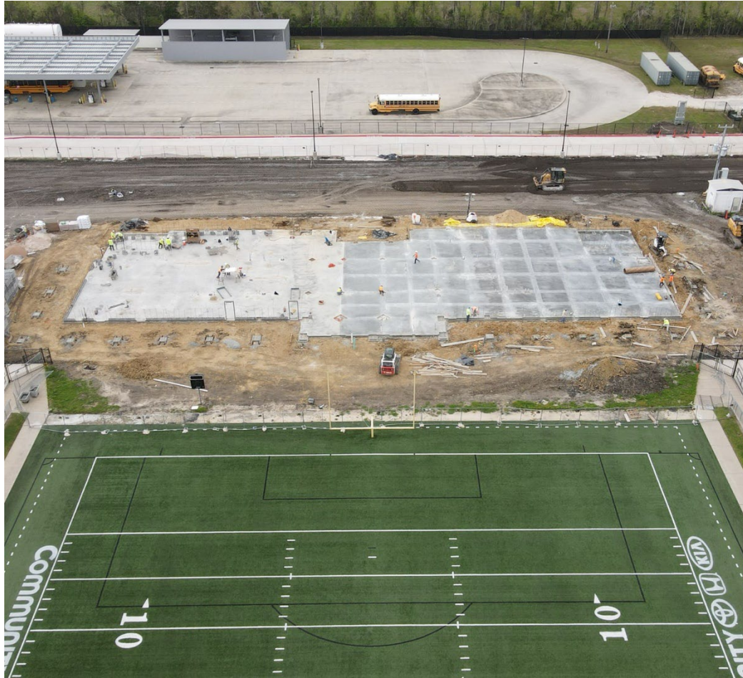
Aerial View – Building Pad