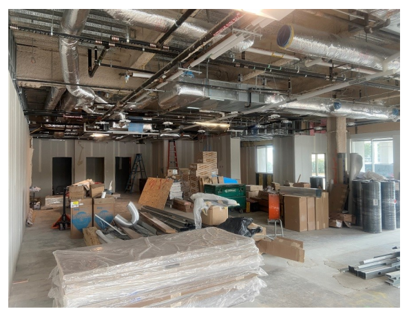
Fitness and Wellness Centers