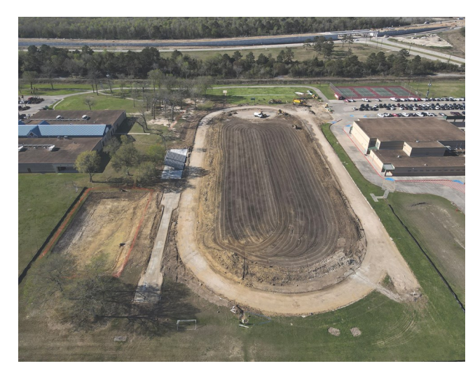
Horace Mann Aerial View