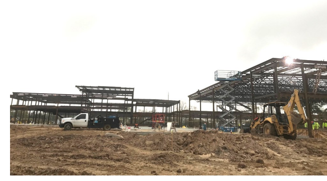
Structural Steel Erection