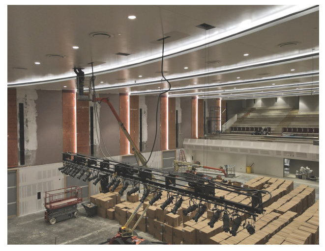
Seating Area Aerial View