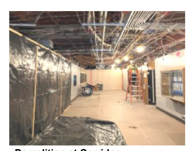
Demolition at Corridor