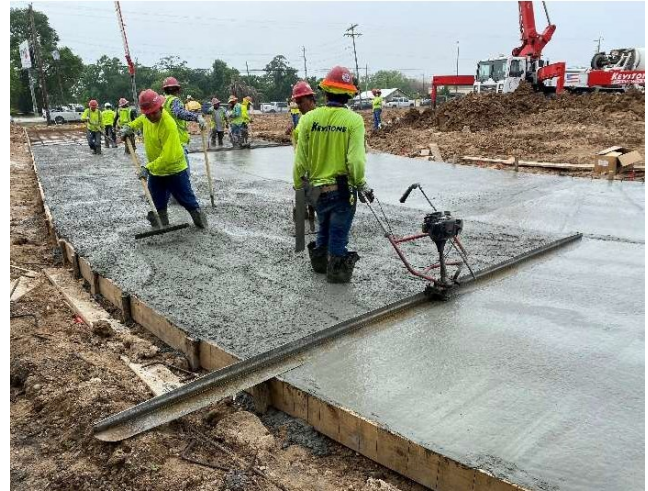
Concrete pour at parent drop-off lane