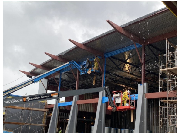
Waterproofing at the media center