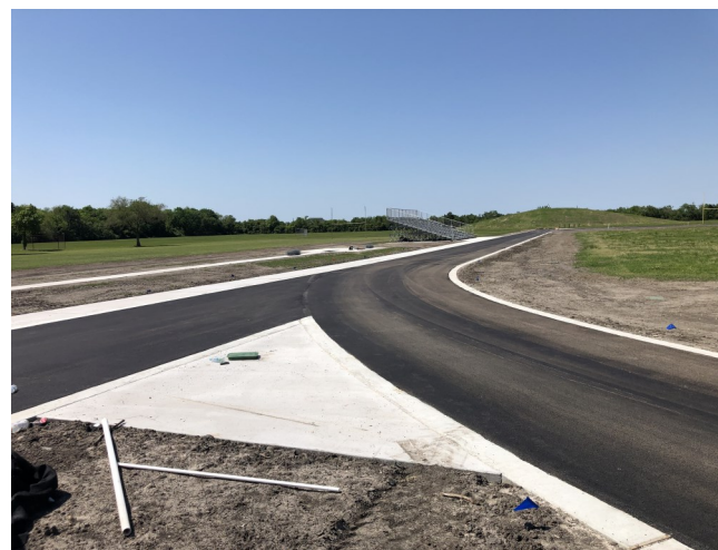
Asphalt base at Gentry JS