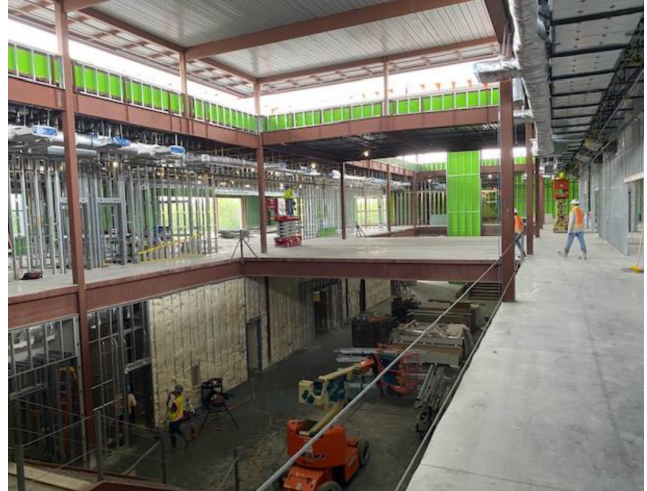
Interior atrium view from second floor