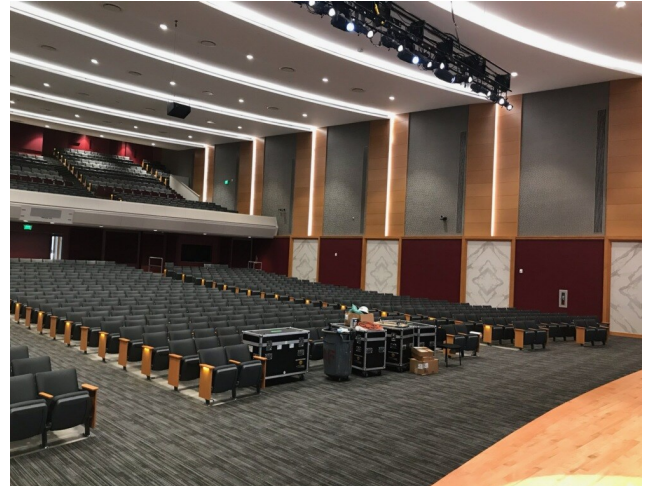
Interior view from stage