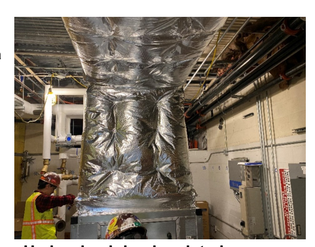
Hydronic piping insulated