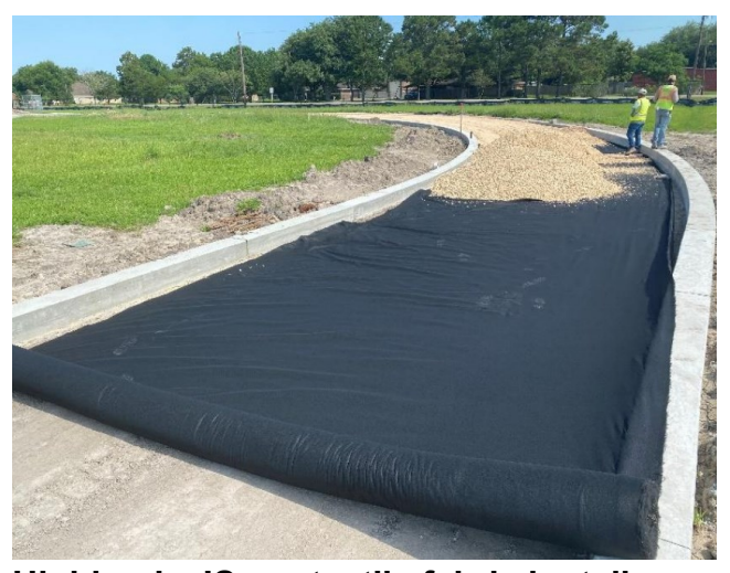
Highlands JS geotextile fabric install