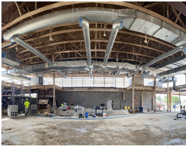
Mechanical duct hanging is ongoing