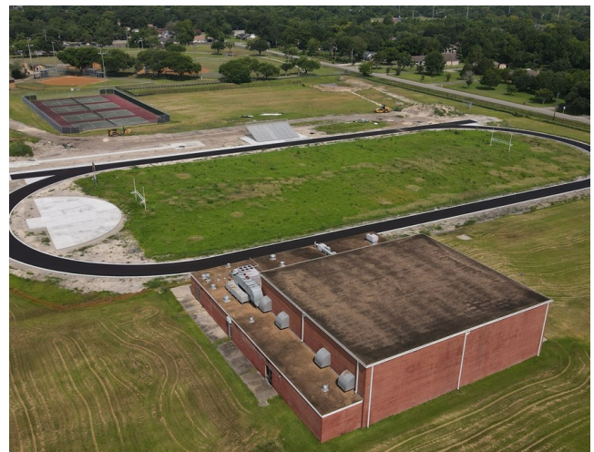
Aerial view at Highlands Junior