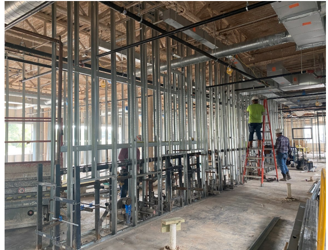
Mechanical duct hanging is ongoing