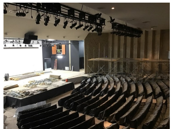
Scaffolding removed in auditorium

GCCISD Facilities Planning and Construction