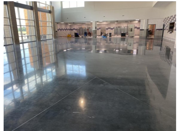
Floor polish complete at cafeteria