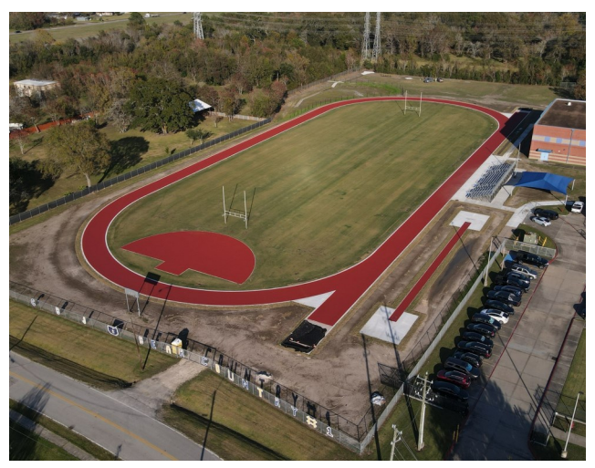
Painting of athletic surface complete at Cedar Bayou JS