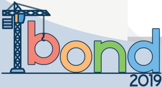
Image to view Citizens Bond Planning Committee