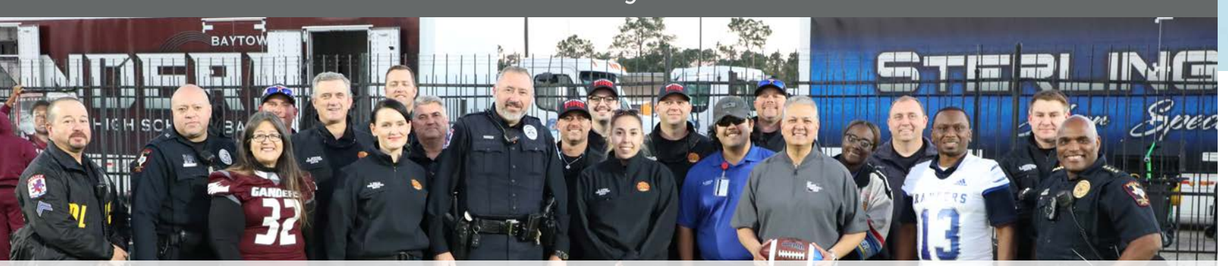
Local first responders were recognized at Lee vs. Sterling football game on November 5, 2021.