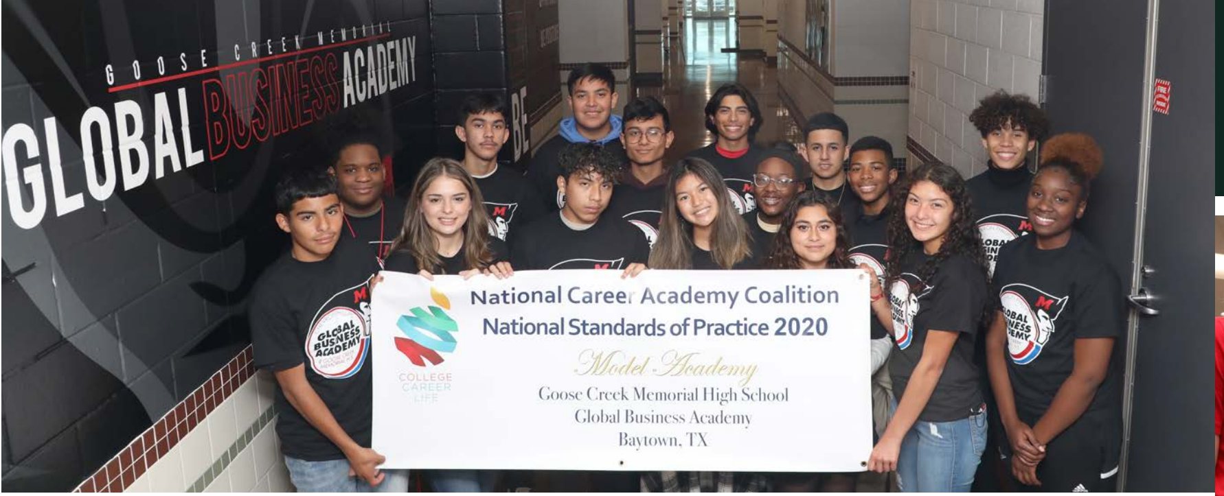
Members of the Global Business Academy at Goose Creek Memorial High School hold NCAC banner.