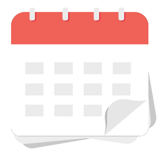
$115 Per Year