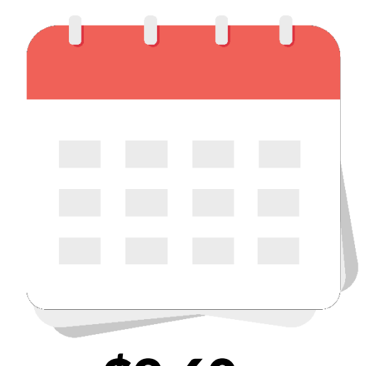
$9.60 Per Month