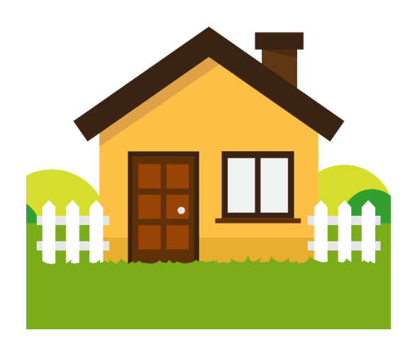
$100,000 Taxable Value