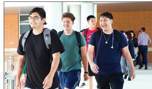
IMPACT Early College High School students head to class on campus and at Lee College.