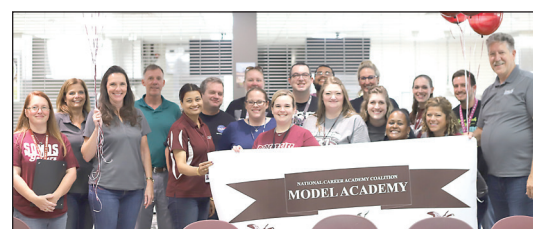
Robert E. Lee High School's STEM Academy receives Model Status recognition.

Goose Creek CISD is fortunate to be able to offer these diverse and specialized educational opportunities so that students may pursue their areas of interest and prepare for college and careers.