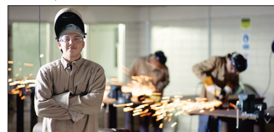
Welding is always a favorite course at Stuart Career Tech High School.