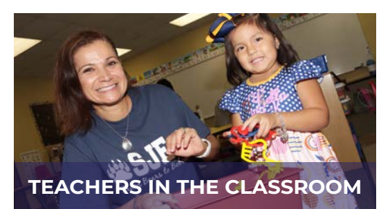
Create a rich learning environment that fosters motivation to learn.

Provide tasks that promote reasoning and problem solving.