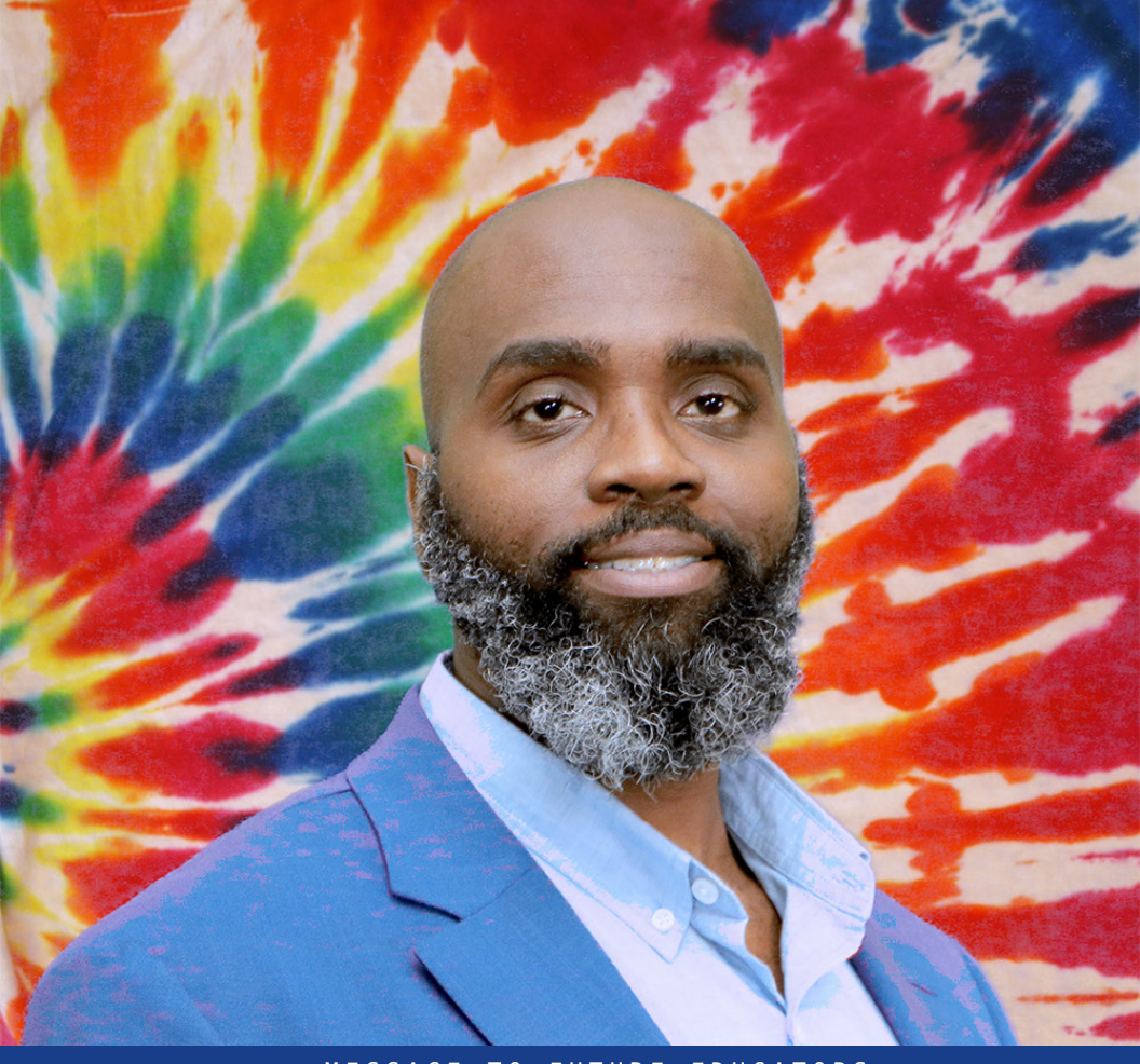
* MESSAGE TO FUTURE EDUCATORS >