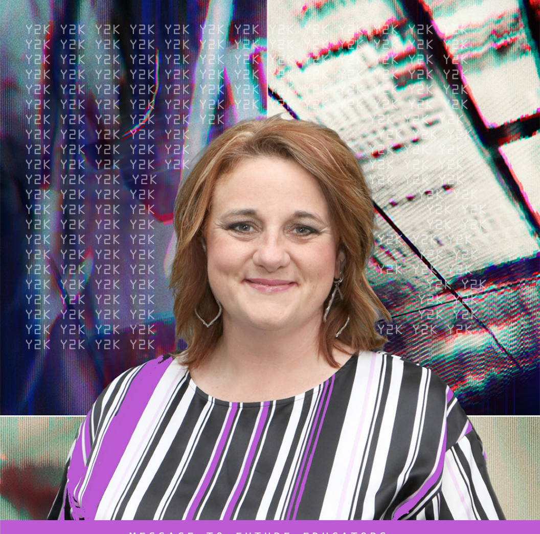
* MESSAGE TO FUTURE EDUCATORS *