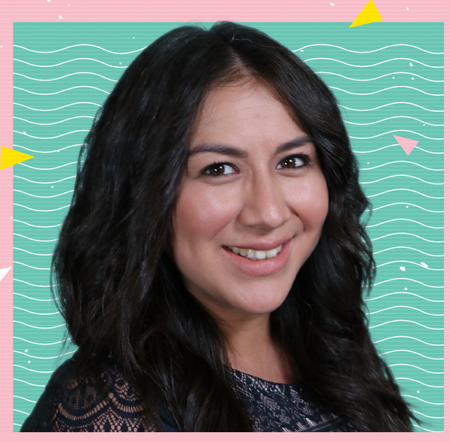
* MESSAGE TO FUTURE EDUCATORS *