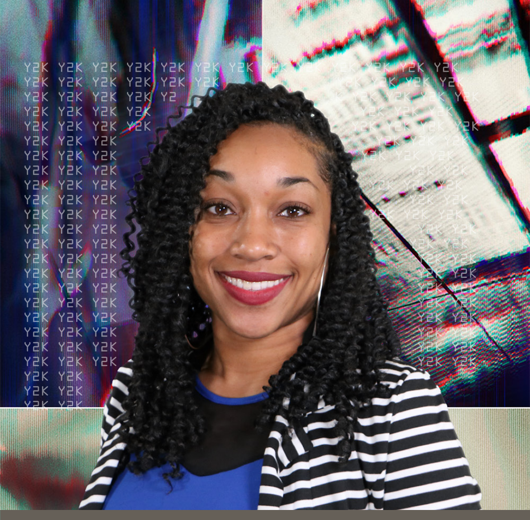
* MESSAGE TO FUTURE EDUCATORS >