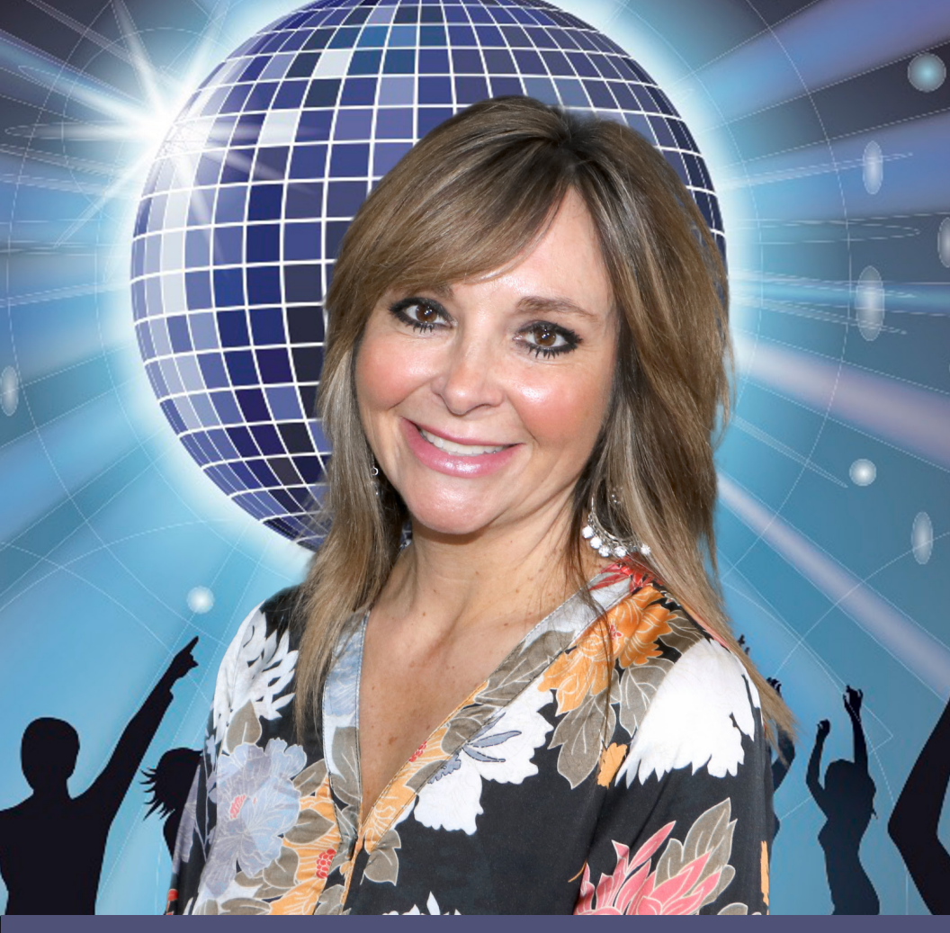
* MESSAGE TO FUTURE EDUCATORS *