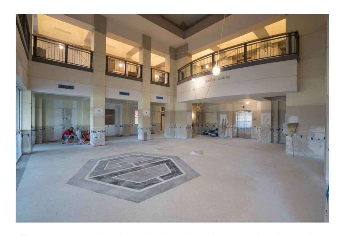
Terrazzo flooring installation is being finalized, final interior painting yet to be complete