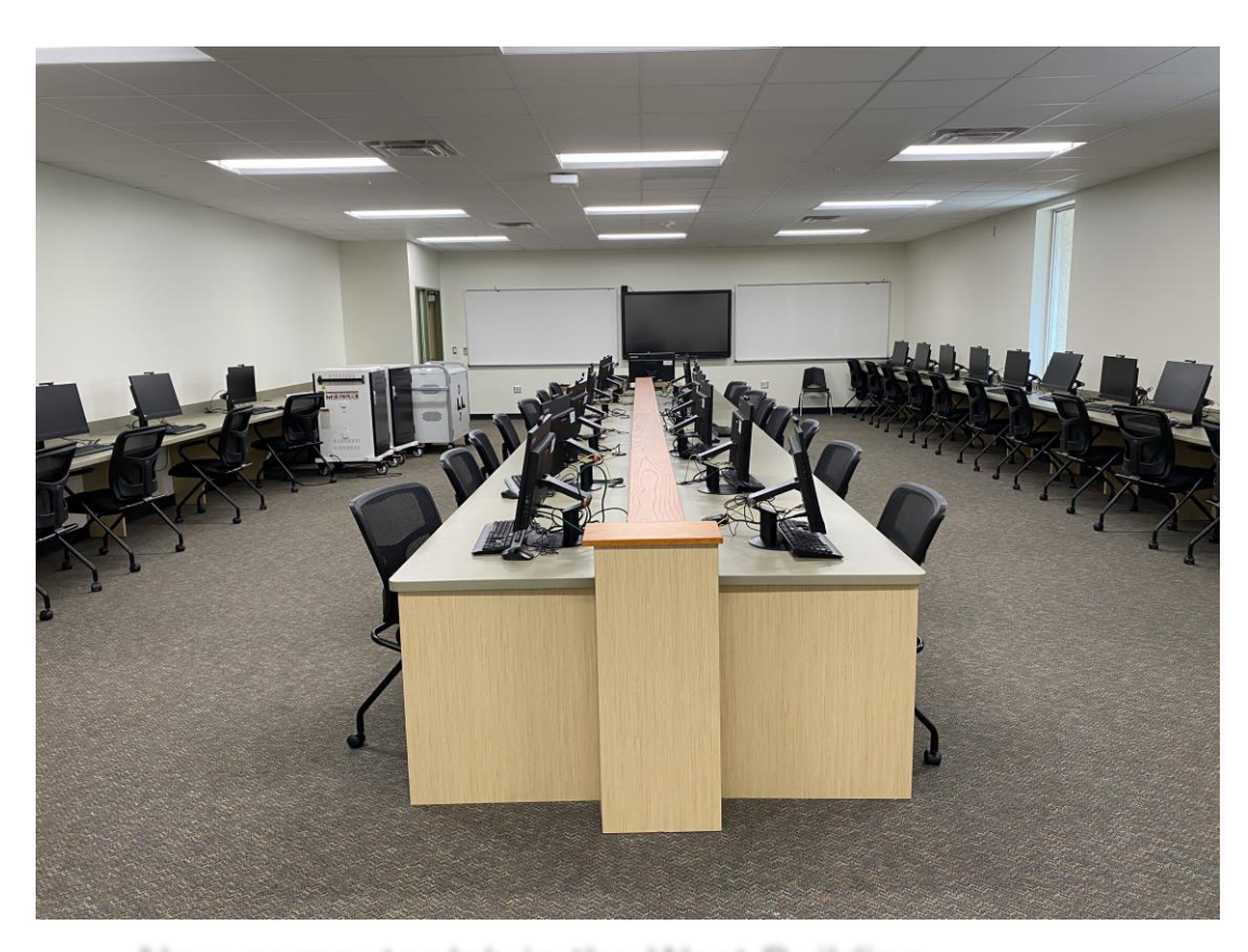
New computer lab in the West Building