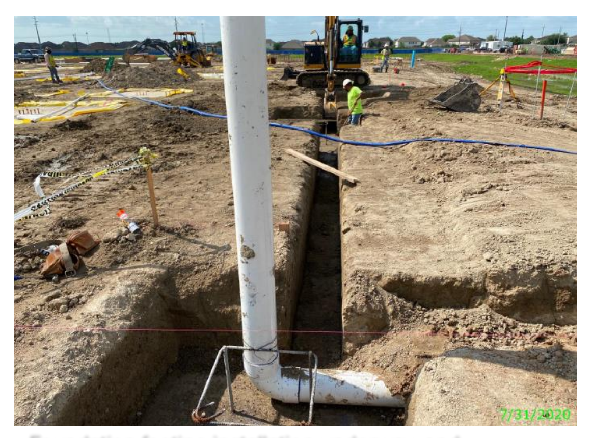
Foundation footing installation underway, and underground plumbing system in progress