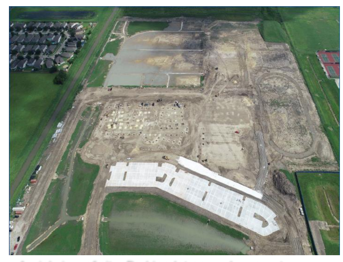
Aerial view of site: Parking lot poured, concrete prep work underway for bus and parent lanes