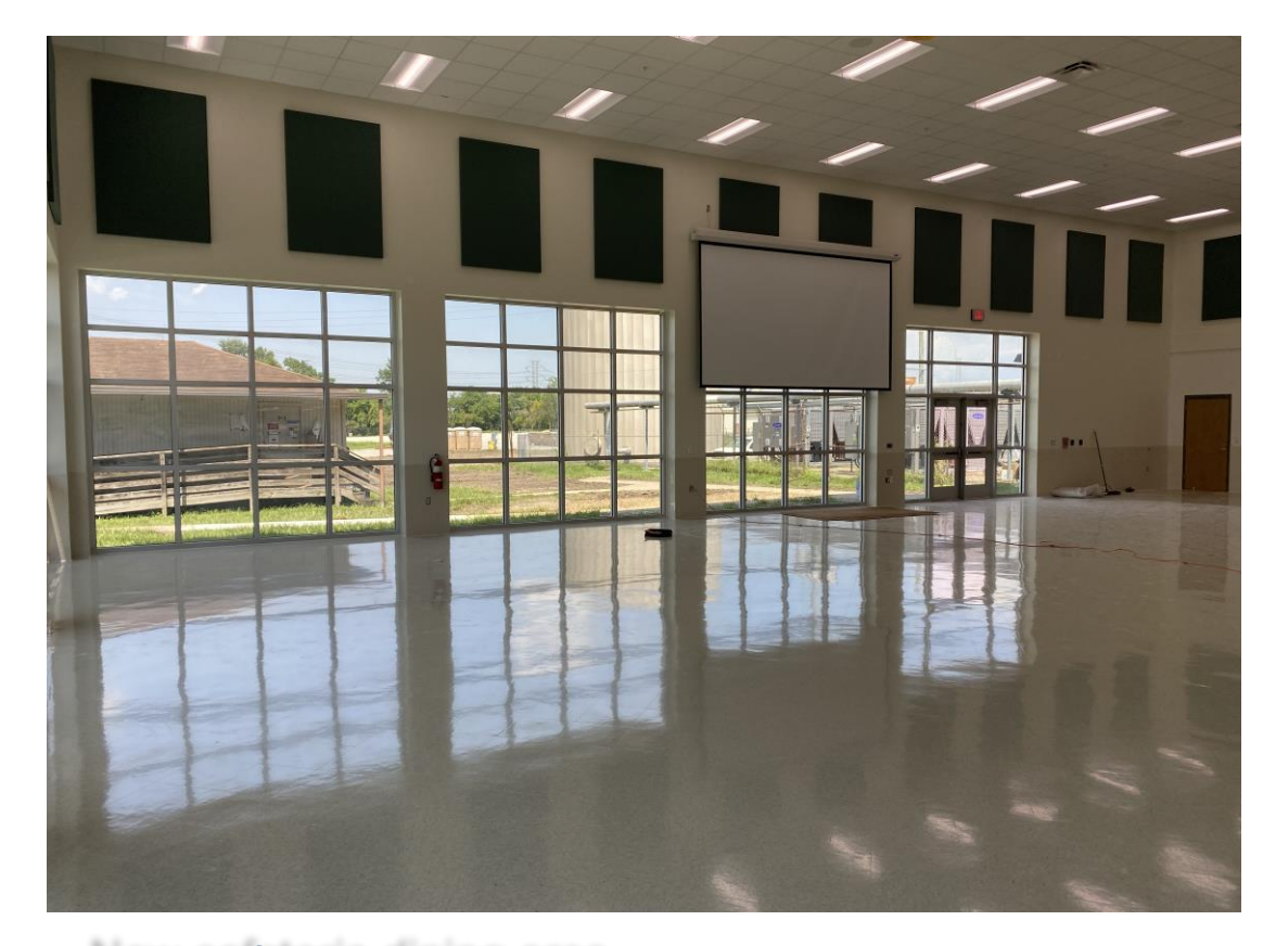
New cafeteria dining area