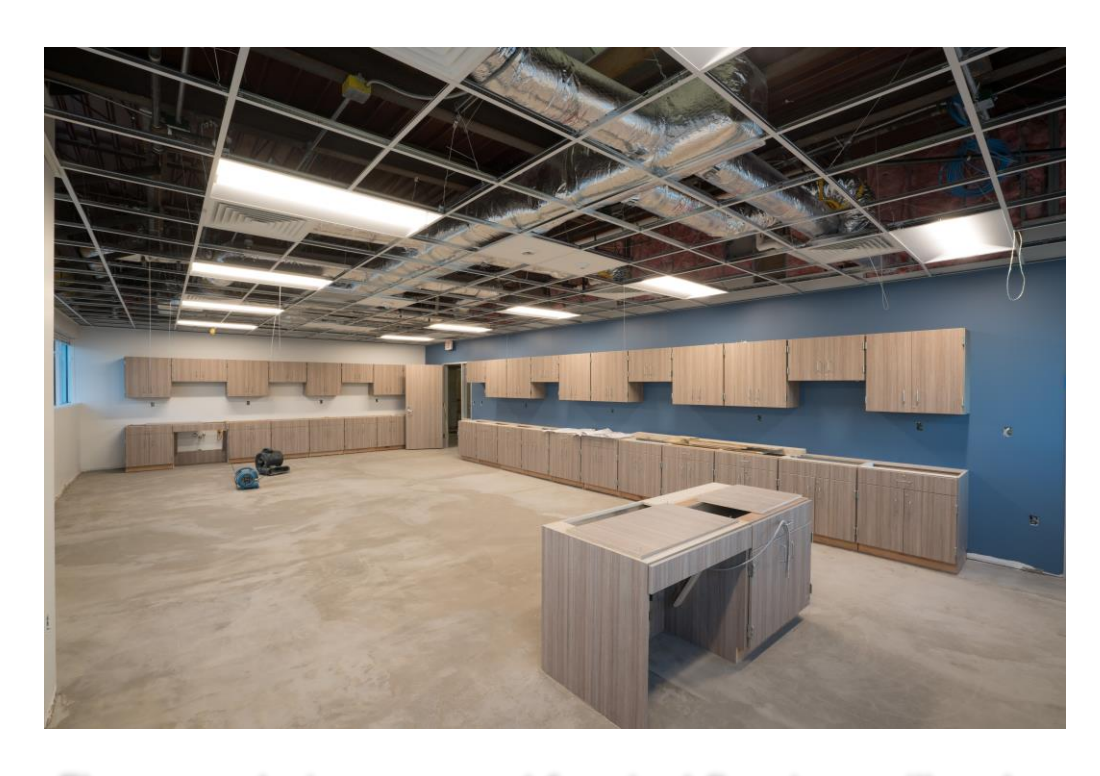
Floors are being prepped for vinyl flooring, millwork installation is underway