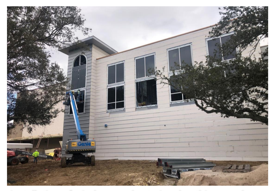
Installation of windows and exterior sheathing nearly complete at Lee High School