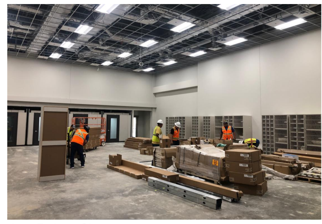
Installation of instrument storage units