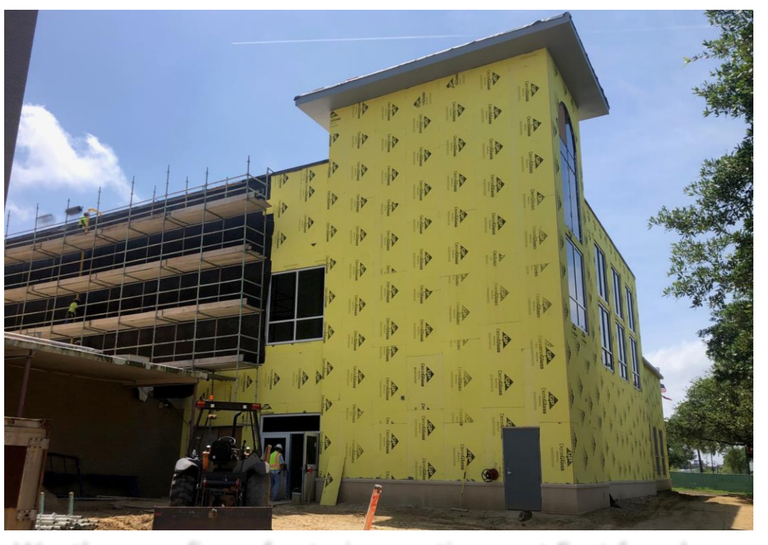
Weatherproofing of exterior continues at East facade