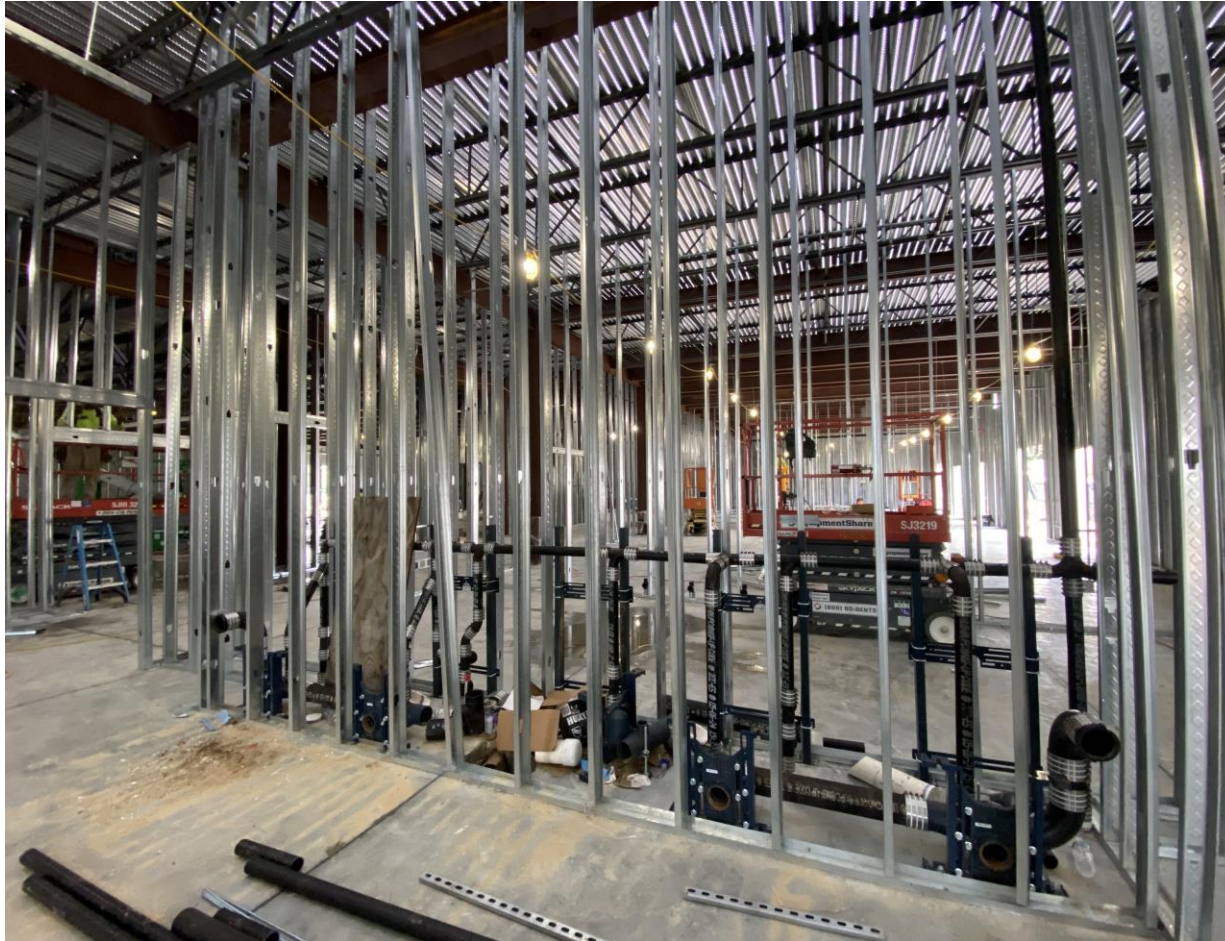
MEP systems top-out