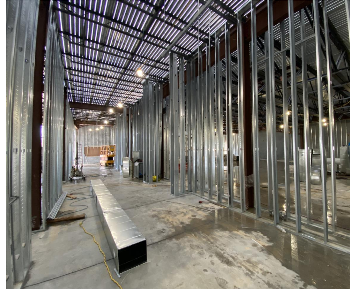
Light Gauge Metal framing Installation