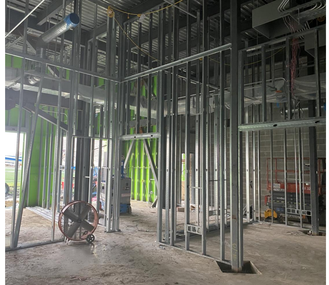
Light Gauge Metal framing Installation