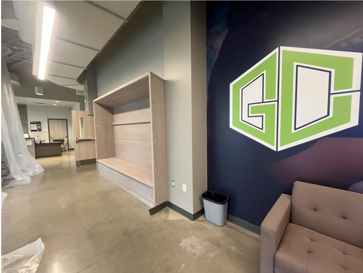
Furniture installation at Main Building