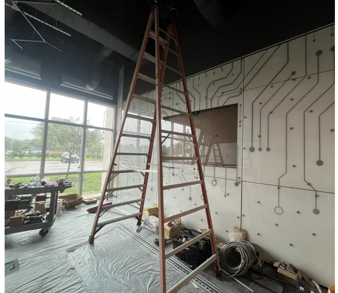
Modular Wall Installation