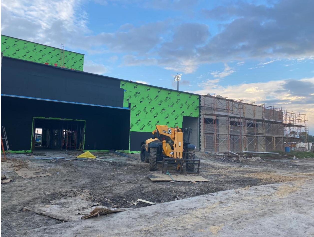
Exterior bricklaying at South Façade