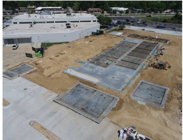
Casting beds and tilt wall formwork complete