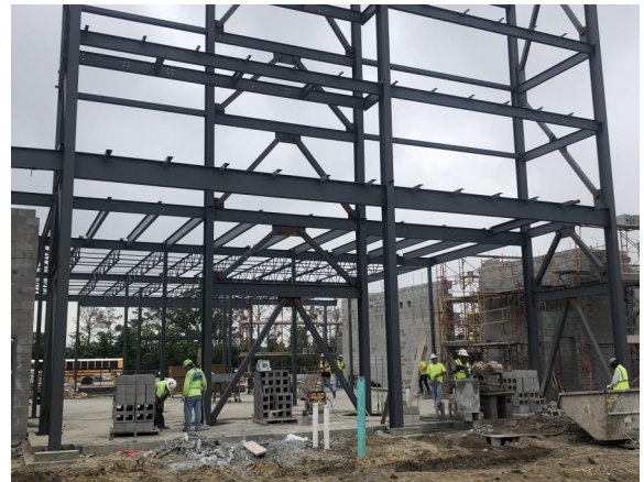
Structural steel complete for new scoreboard

GCCISD Facilities Planning and Construction