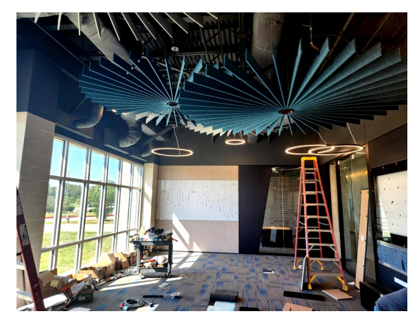
Lighting fixtures in expansion