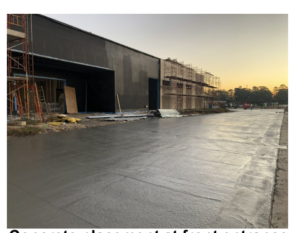
Concrete placement at front entrance