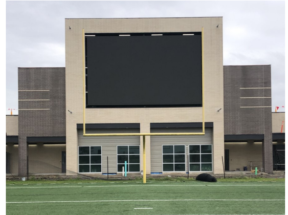
New digital scoreboard installed