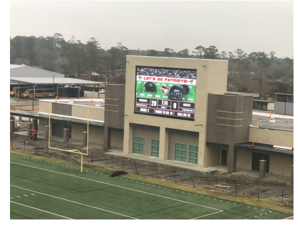
New digital scoreboard operational