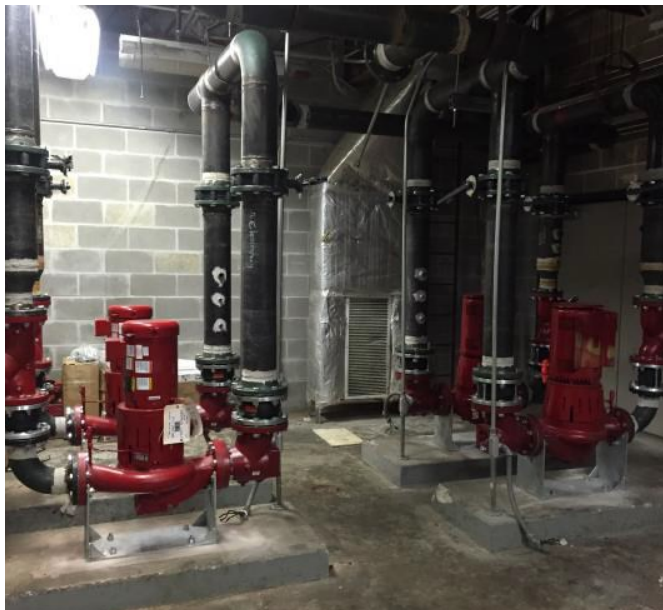
New chilled water pumps and piping have been installed at Austin.