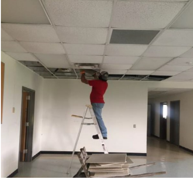
Demolition of ceiling tiles at Highlands Junior is underway.