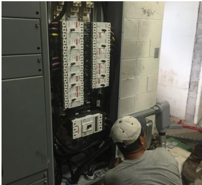
New panel being installed at Harlem