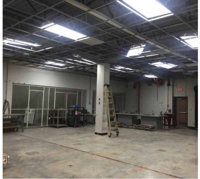
Demolition and cleanup at Horace Mann has taken place.