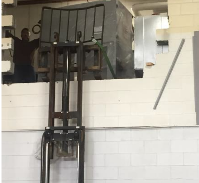
Moving air handler to gym mezzanine at Harlem

At DeZavala, Harlem, and Highlands Elementary, all but three of the fan coil units have been set and all of them have been connected electrically . Piping modifications to connect the FCU's continue at all three schools. Air handlers continue to be removed and the new ones are being set in place. All of the new MCC's have been installed, electrical panels are being demolished, and new ones are being installed. Chilled water pumps have been replaced at two of these three schools and the old ones have been removed at the third school. The boilers at all three schools have been removed.