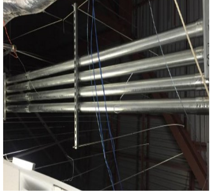
New electrical conduit was installed at Austin