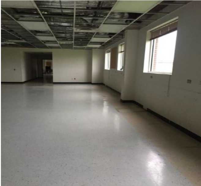
Demolition of cabinets at Highlands Junior has been completed.