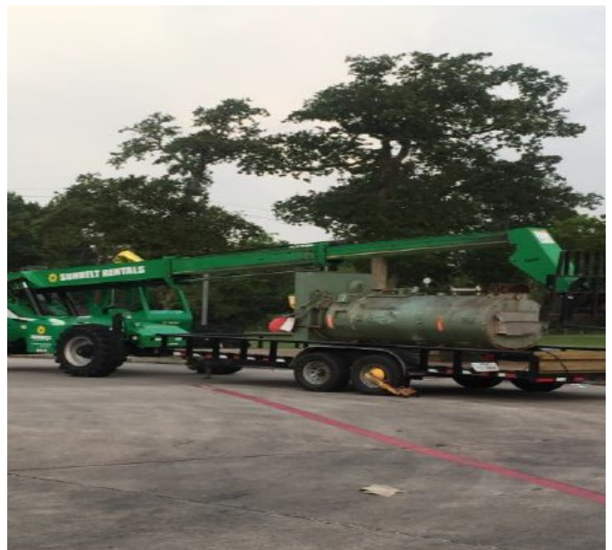
Old boiler removed at DeZavala