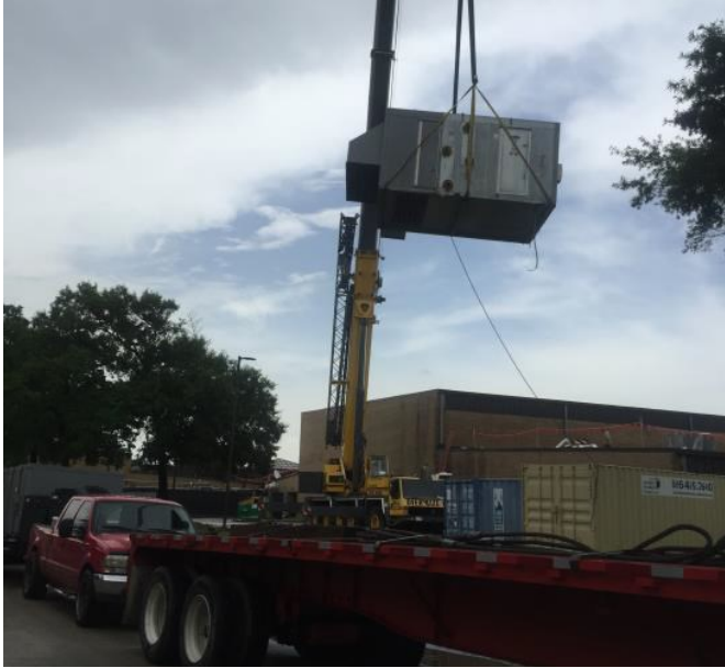
RTU being removed from gym roof at Baytown Junior.