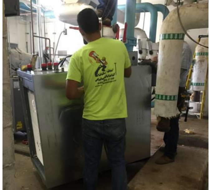
Preparing to lift air handler in mechanical room at Harlem