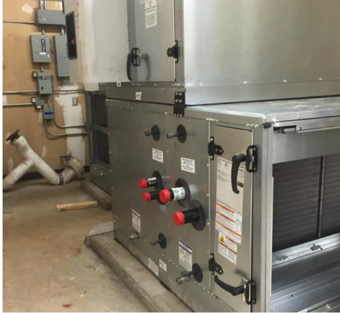
Air handlers at Hopper have been set on housekeeping pads.