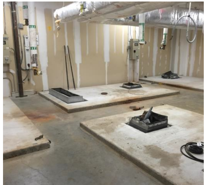
This room is awaiting new air handlers at Ashbel Smith.