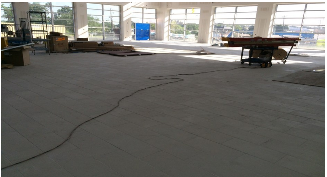
The installation of ceramic tile in the commons area is 95% complete.