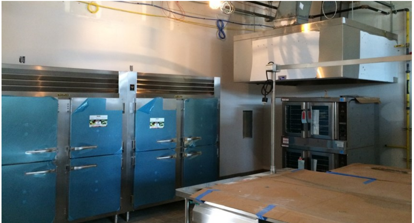
Kitchen equipment has been installed in the kitchen/serving area.