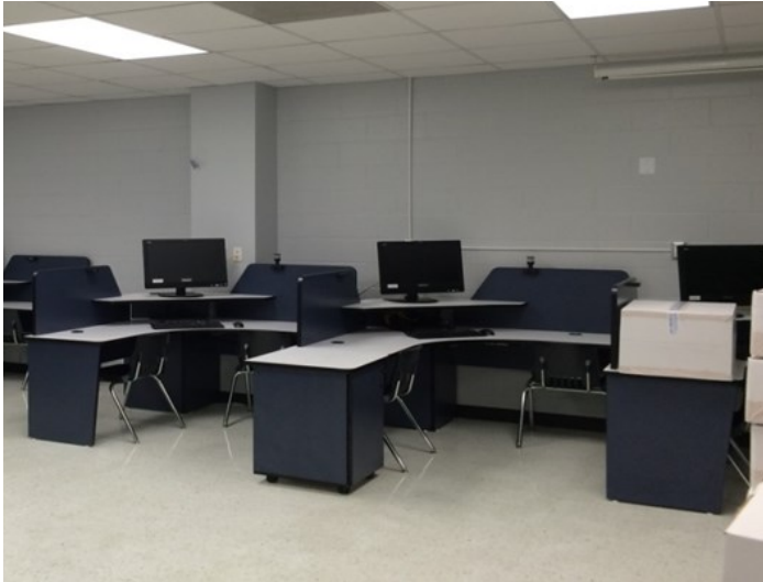
Furniture and computers are installed at Cedar Bayou Junior STEM Lab.