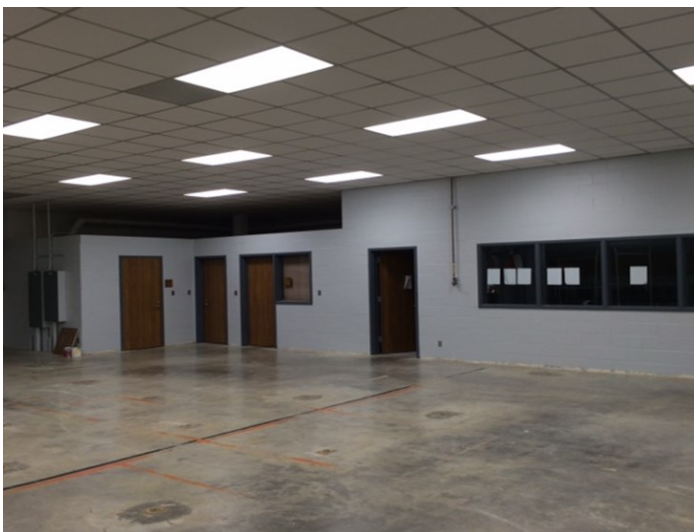
Demolition, renovations, new ceiling and painting is complete at Horace Mann Junior STEM Lab. The new flooring is in process at this time.