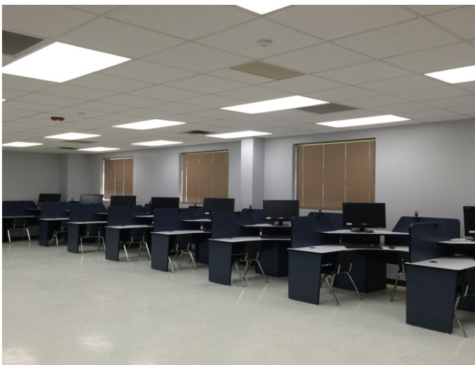
Furniture and computers are installed at Highlands Junior STEM Lab.