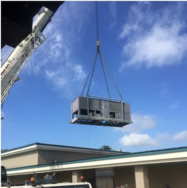
A temporary chiller is being set up at Austin . AC system is up and running as of Friday, July 24th. The new chiller is to be delivered on August 24th and will be set over the labor day weekend.