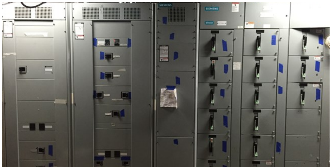
The new MSB at Gentry has been installed.