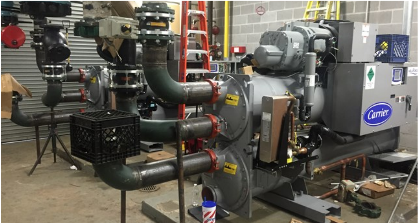
The new chillers at Ashbel Smith were delivered. They have been set and are now being piped.