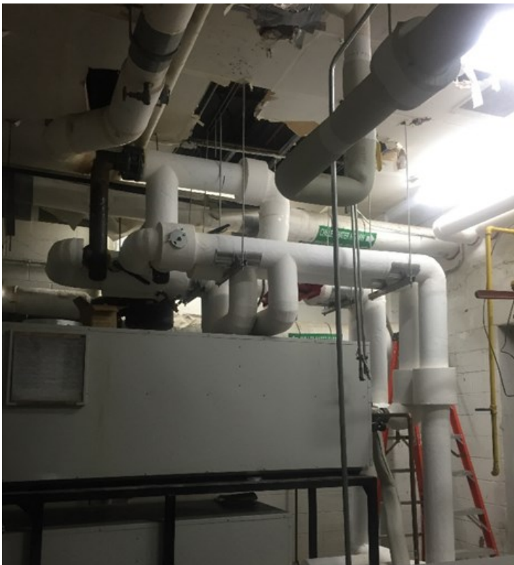
Piping for new boilers at Horace Mann have been insulated.