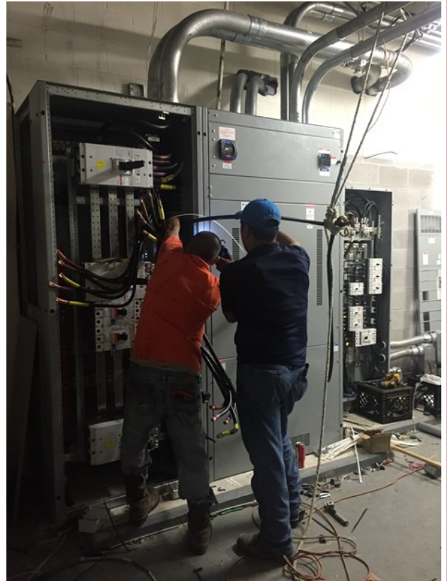
The new MSB at DeZavala has been installed.