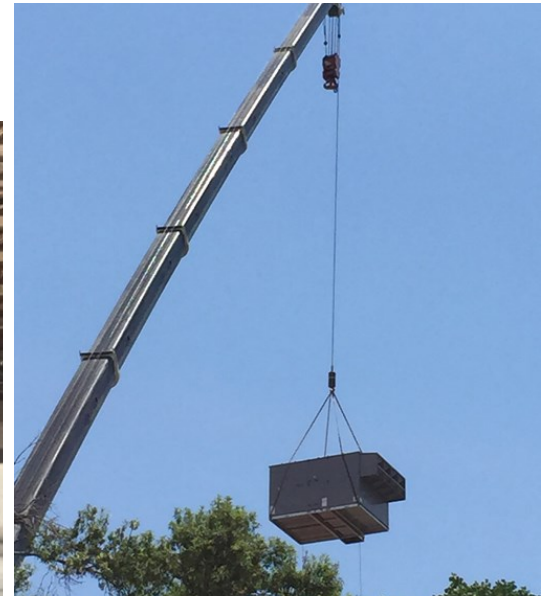
All roof top units at Baytown Junior have been set.