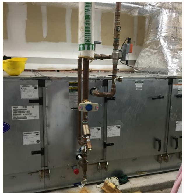
All of the new AHU's at Ashbel Smith have been piped and insulated. AC expected to start up by Friday, July 31st.