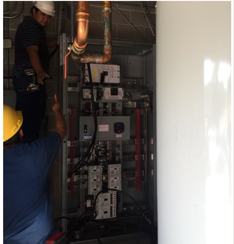
The new MSB at San Jacinto is being set up.