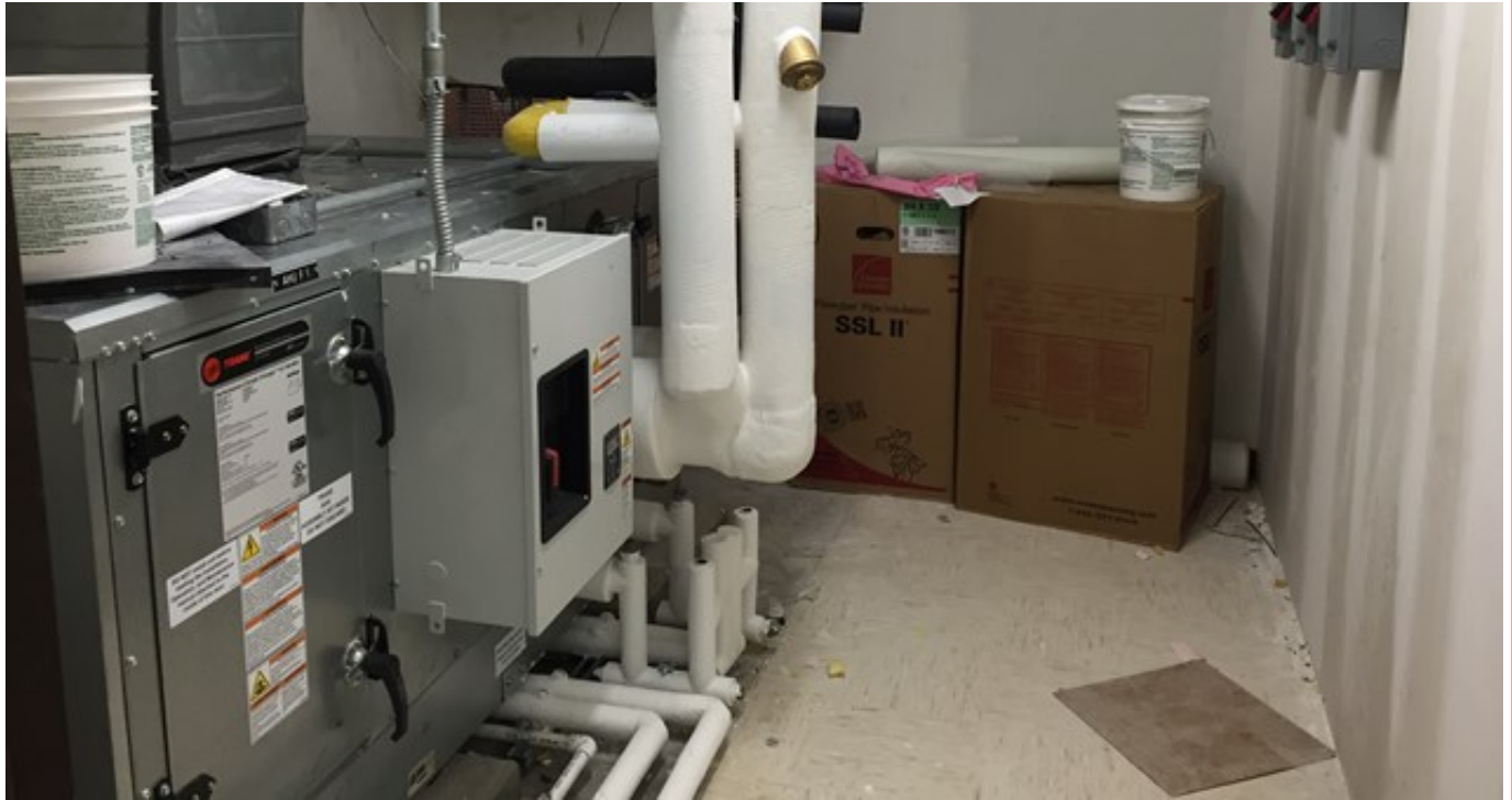
The new AHU piping and ducting have been connected at Hopper .