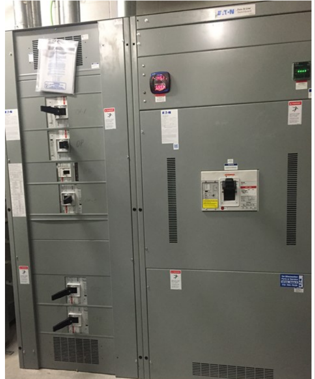
The new MSB at Horace Mann has been installed.