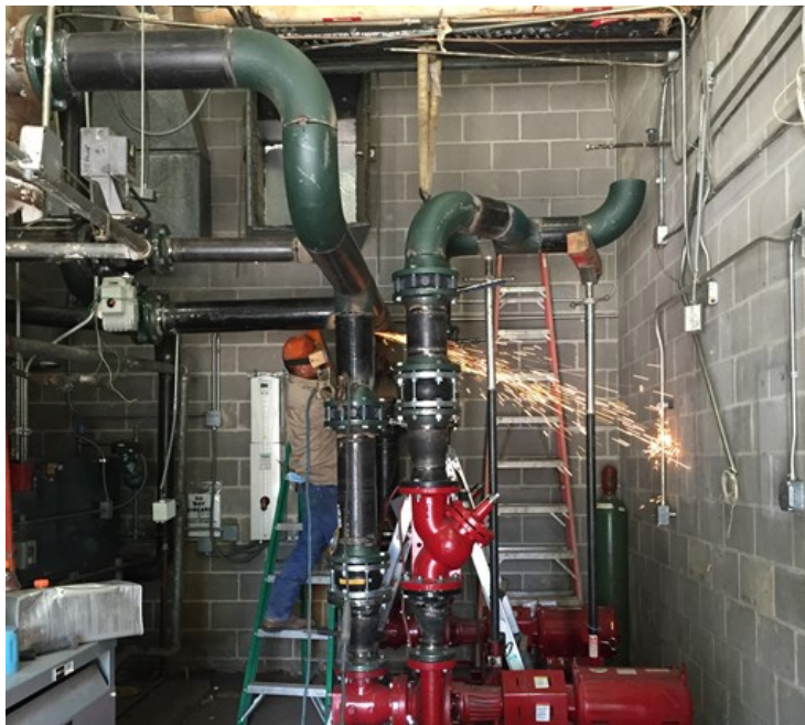
The new condenser water piping is being installed at San Jacinto .