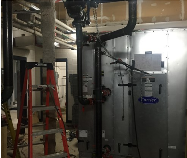
The air handler piping is has been completed at Cedar Bayou , along with insulation and ducting.