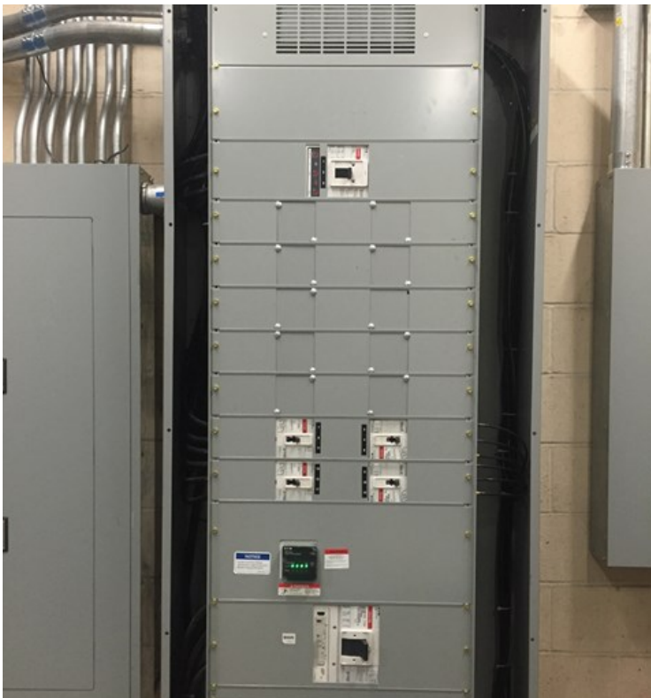
The new distribution panel is being installed in the RSS Ag Science building.