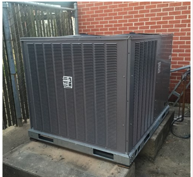
The DX unit at Cedar Bayou Special Education Building has been set.

The AC is running at Ashbel Smith, Lamar, Highlands Elem., Hopper, Horace Mann, Harlem, Gentry, and Baytown Junior to debug the systems. Controls at all campuses are working.