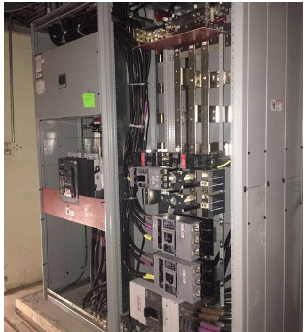
The new MSB at Crockett is waiting on city inspection for August 4th.