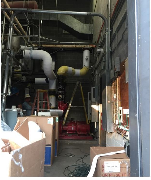
The condenser water piping is being installed at San Jacinto .