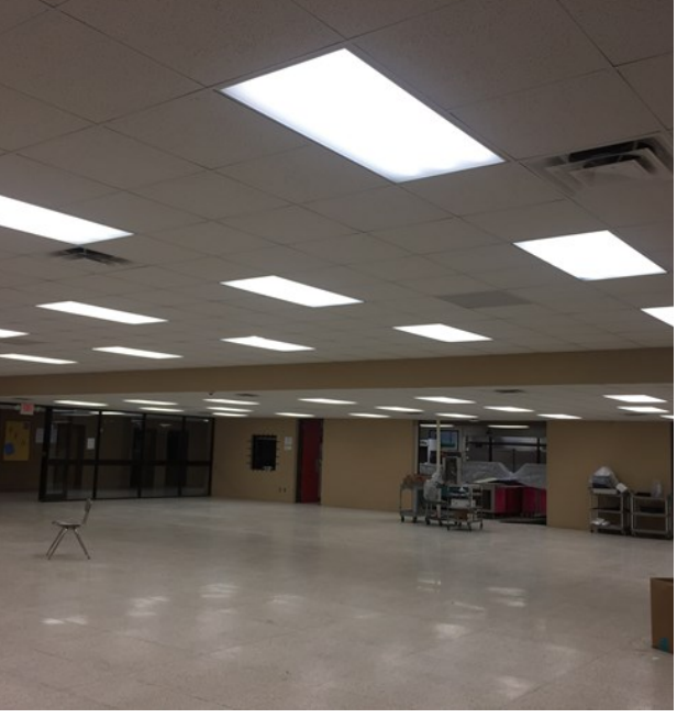
Baytown Junior cafeteria.