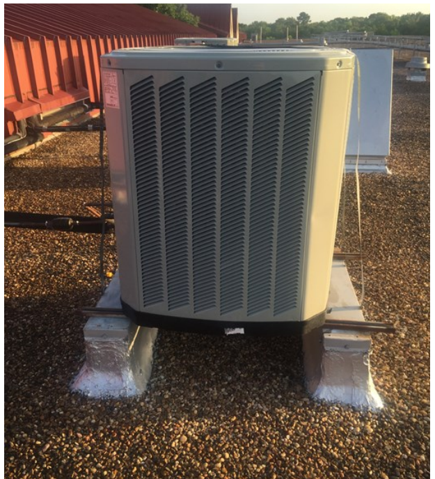
The new library DX roof systems have been installed at DeZavala , Harlem and Highlands .