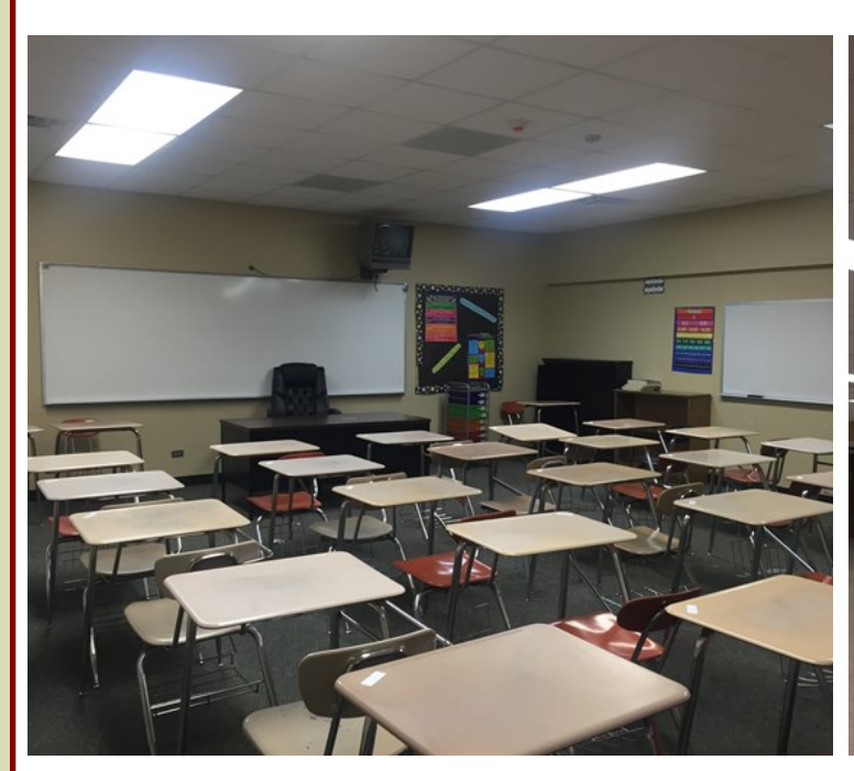
All Gentry classrooms have been set up except for the fine arts and the STEM lab.