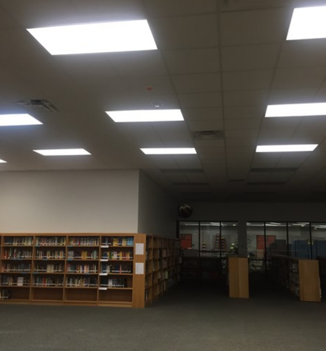
Before and after of Gentry's library grid.