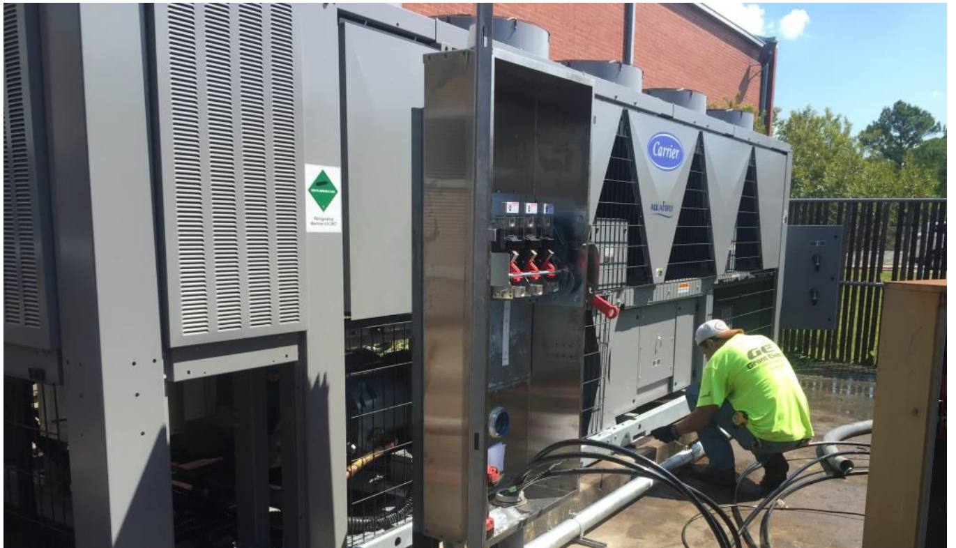
The new air chiller has been set at Cedar Bayou Junior School.