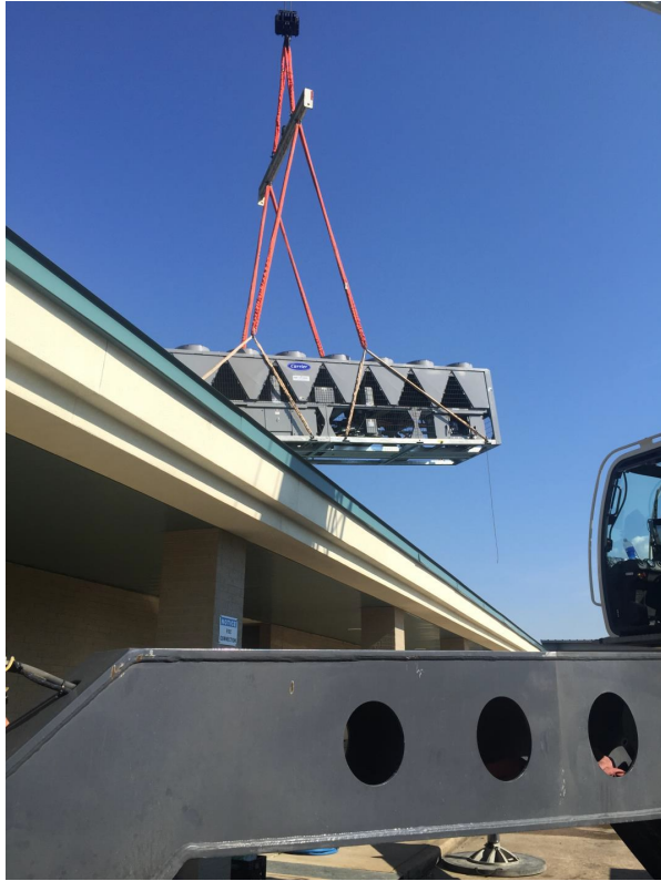
Air chiller number one is being lifted into place at Austin Elementary School. (Left)