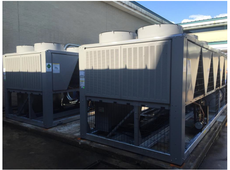
The new chillers are set at Austin Elementary. (Below)