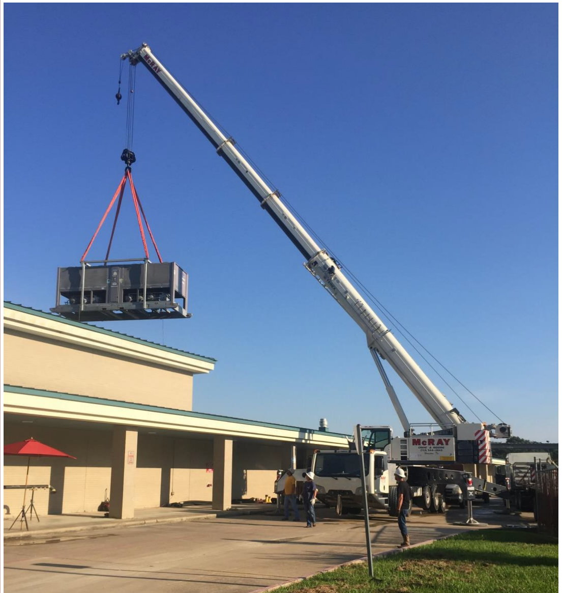
Temporary chillers being removed from Austin Elementary School.