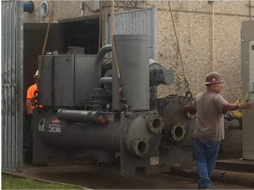
The old chiller was removed at Gentry Junior High.