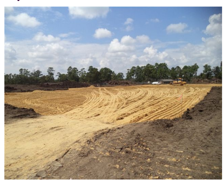
Preparing the pad at the 146 site