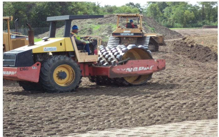
Knock down and compaction of import fill materials