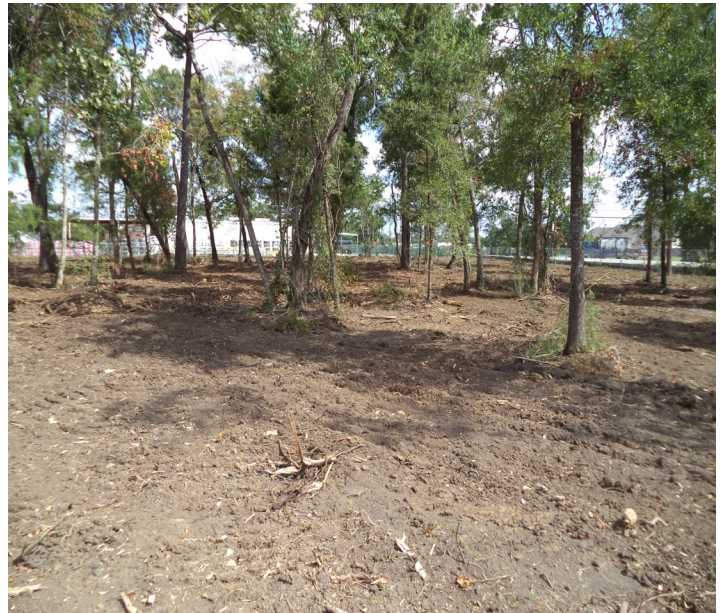
Site clearing has been completed