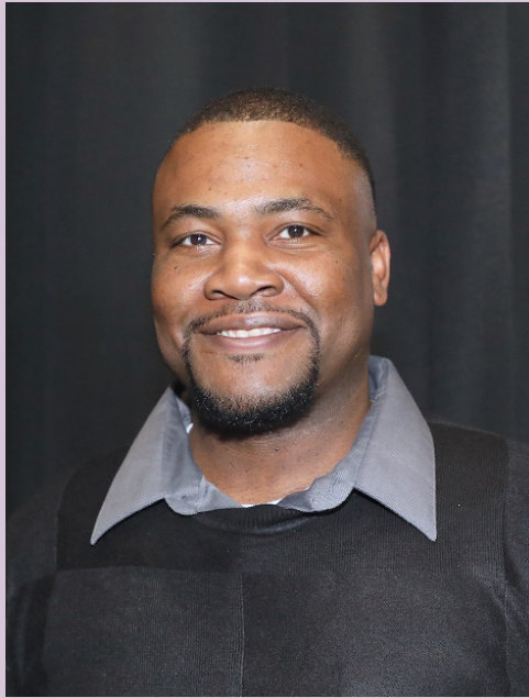
TROJAN NOBLE Ross S. Sterling HS