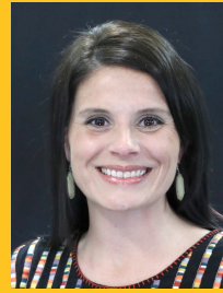
TARA FOUNTAIN GENTRY JUNIOR SCHOOL