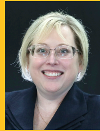
CHRISTINA MARIONEAUX GENTRY JUNIOR SCHOOL